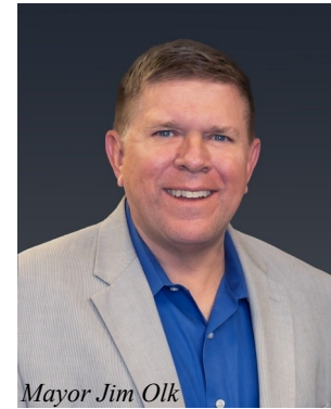
Mayor Jim Olk