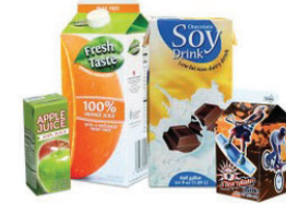
Milk Cartons & Juice Boxes