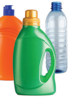
Plastic Containers #1-5 & #7