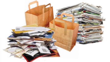
Mixed Paper, Newspaper, etc.