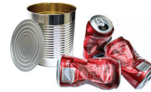
Aluminum, Steel, & Tin Containers