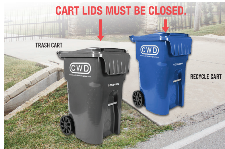
Place carts at least 3 feet apart, with wheels toward residence.

Do you have a damaged cart that is in need of repair or replacement? Please contact CWD at 972.392.9300, Option 2 for assistance.