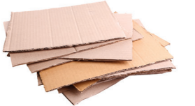
Corrugated Cardboard & Boxboard