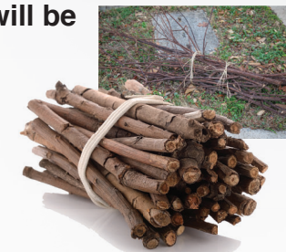
Examples of Bundled Brush

Tied and bundled brush will be collected, in unlimited quantities , once a week on your regular trash pickup day. Tied and bundled brush must weigh less than 50 lbs., and be no longer than four feet.