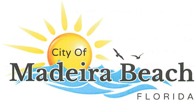
Exhibit A Ordinance 2023-18