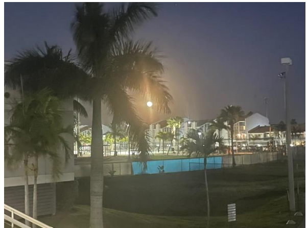
February Full Moon-View at City Hall

I hope many of you enjoyed our various meetings, activities, and events throughout February including the return of the annual College Softball Spring Games, beach clean-ups, and our Commission meetings. Please continue reading to learn of March meetings, activities, and events, all listed on the City's website: www.madeirabeachfl.gov .