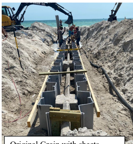
Original Groin with sheets installed ready for concrete