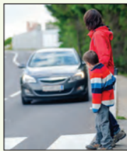
Ensure all lanes of traffic have stopped for you at the crosswalk before you cross, not just the lane closest to you.

If there are no sidewalks, walk on the side of the road facing the traffic so you can see the cars coming and step off the road in a hurry.