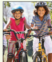
Attach a day-glo stick or reflective tape to your bike to be more visible.