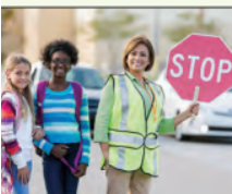
It is easier to see a group of pedestrians with a crossing guard.

Don't text while driving! Texting can wait. The road traffic needs your full attention.