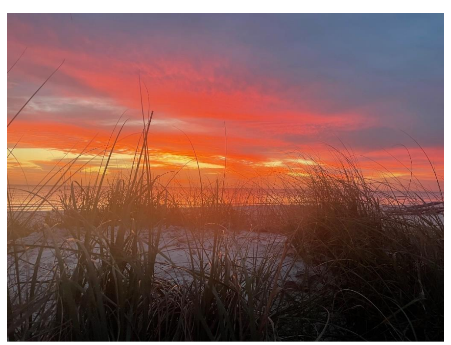
Eclectic Gulf Sky shortly after sunset

I hope many of you enjoyed our various meetings, activities, and events throughout January including the annual Seafood Festival at John's Pass Village, Final Friday at the John's Pass bell tower area, a beach clean-up, and our Commission meetings. Please continue reading to learn of February meetings, activities, and events, all listed on the City's website: www.madeirabeachfl.gov.