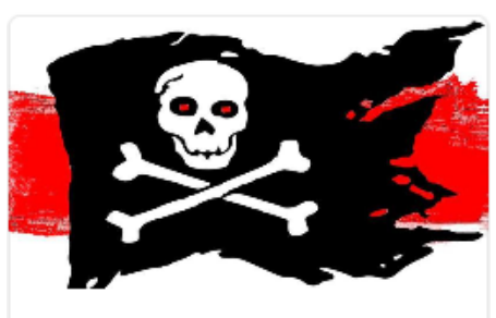
Trash Pirates Of Mad Beach

Thank you to all the wonderful volunteers, family, and friends that continue to make our community a better place to live, learn, work, and play. The pounds and pounds of trash removed at the clean-up on January 6 truly made our slice of paradise shine. The City very much appreciates all your efforts. Please continue to look forward to future monthly clean-ups by the Trash Pirates and Trash Turtles of Madeira Beach.