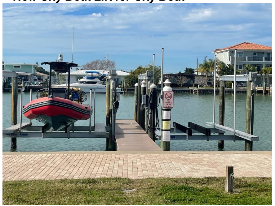
Adjacent to the City's Fire Rescue Boat