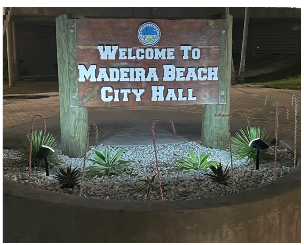
New City Hall sign on new landscaped area