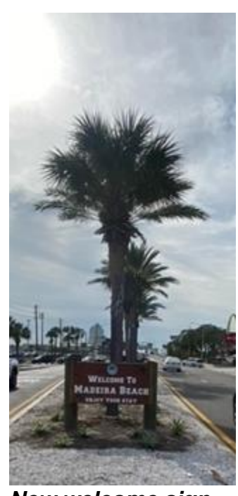
New welcome sign