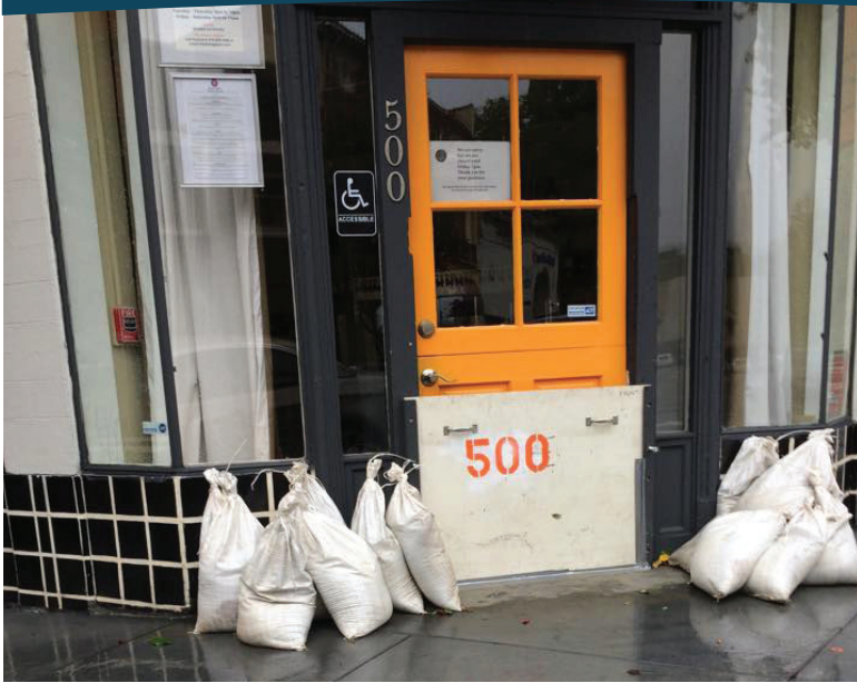
Merchants prepare for stormy weather by protecting storefronts with sandbags and floodgates.