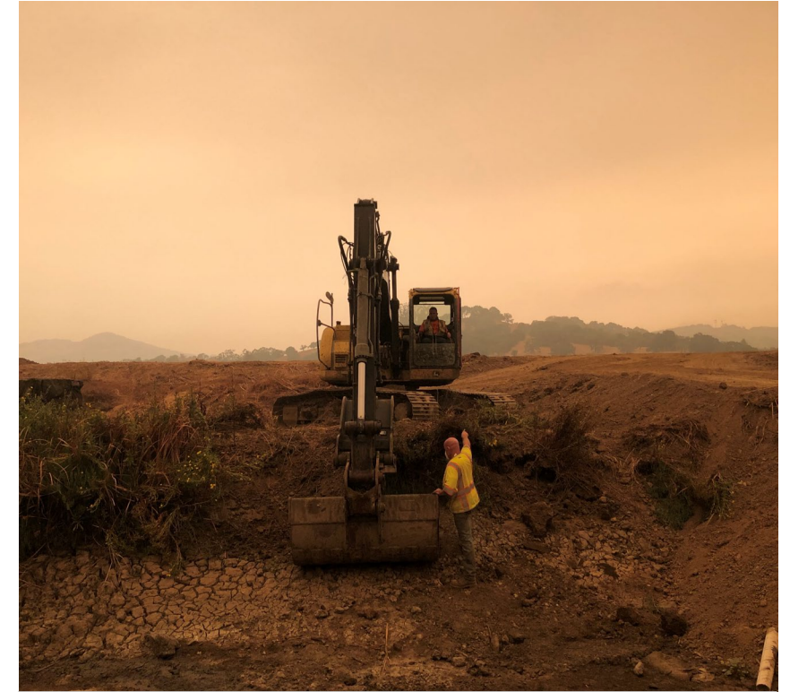
Sediment Removal 2020