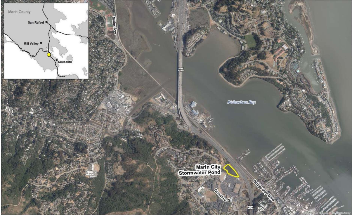
Figure 1: Marin City Stormwater Pond Site Location Map