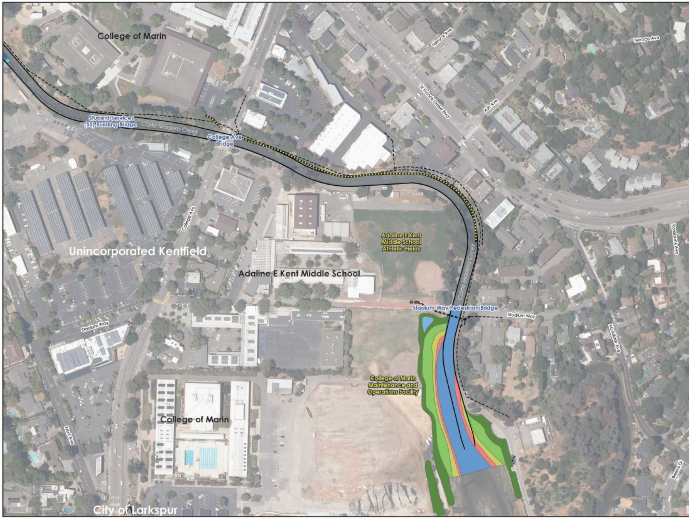
Map 3 of 3