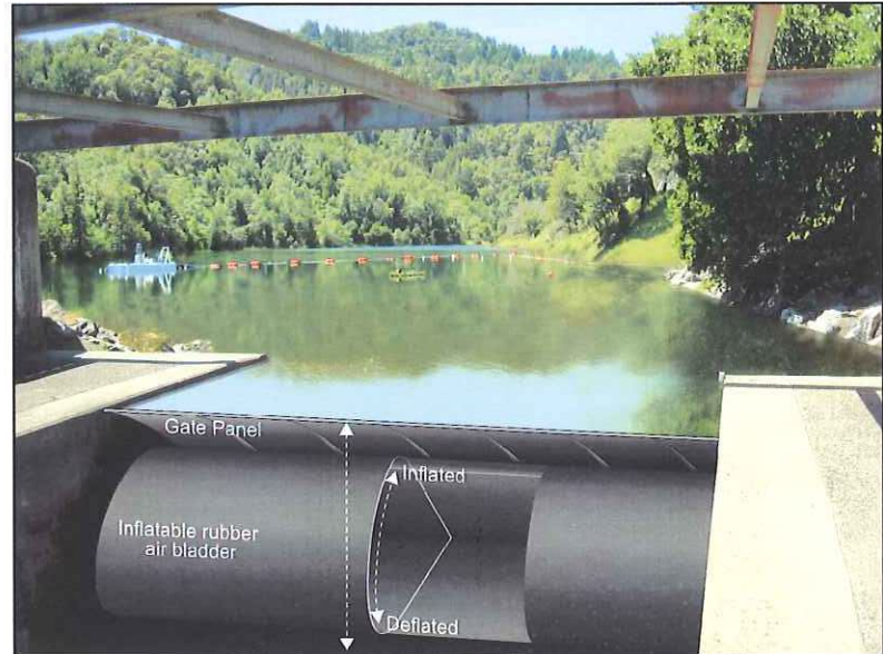
Grant proposal includes a 6-foot high pneumatic spillway gate that would increase lake storage capacity by 120 acre-feet providing both flood detention and water supply benefits.

Submitted to: Department of Water Resources