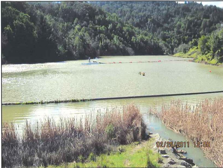
Phoenix Lake provides a variety of recreational opportunities for visitors from throughout the Bay Area. Photo shot from the dam crest showing the floating barge water supply pump station.