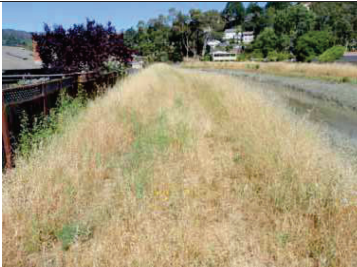
Coyote Creek Right Bank (~Sta 44+65): Crest of levee looking upstream