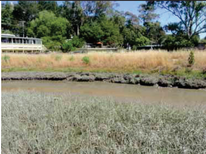
Coyote Creek Left Bank (~Sta 48+40): View of waterside toe erosion at GEI Cross-Section 4 from Coyote Creek Right Bank