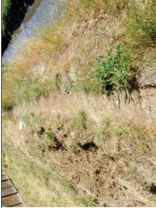
Nyhan Creek Left Bank: Crest of GEI Cross-Section 1 looking downstream located ~100 feet north of Crest Marin Pump Station