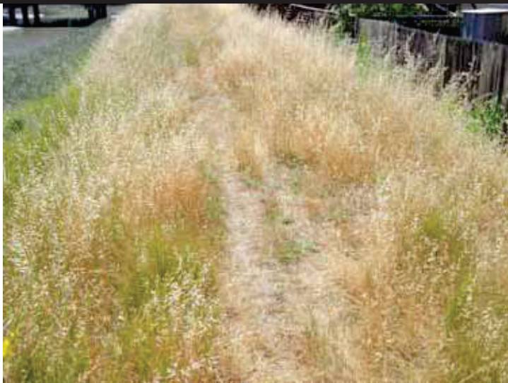
Coyote Creek Right Bank (~Sta 46+40): Crest of GEI Cross-Section 3 looking downstream located