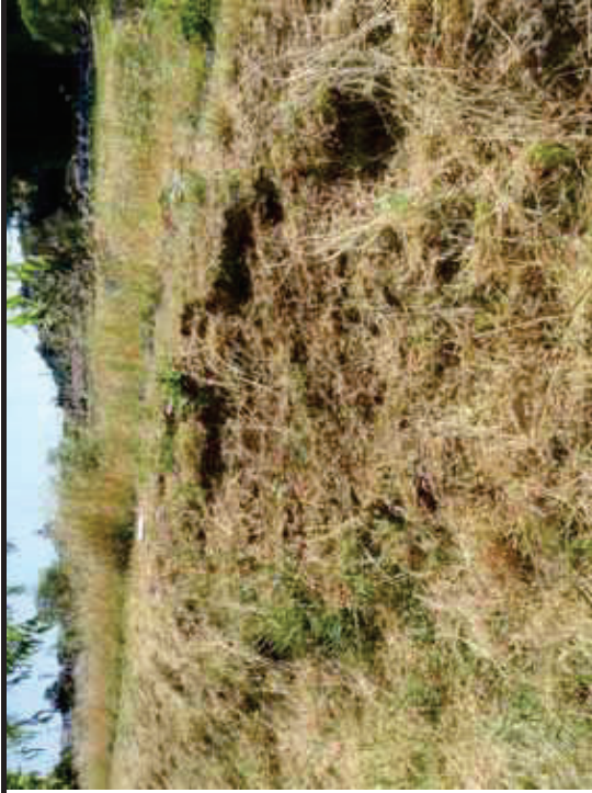
Nyhan Creek Left Bank: Landside slope of GEI Cross-Section 1 looking downstream located ~100 feet north of Crest Marin Pump Station