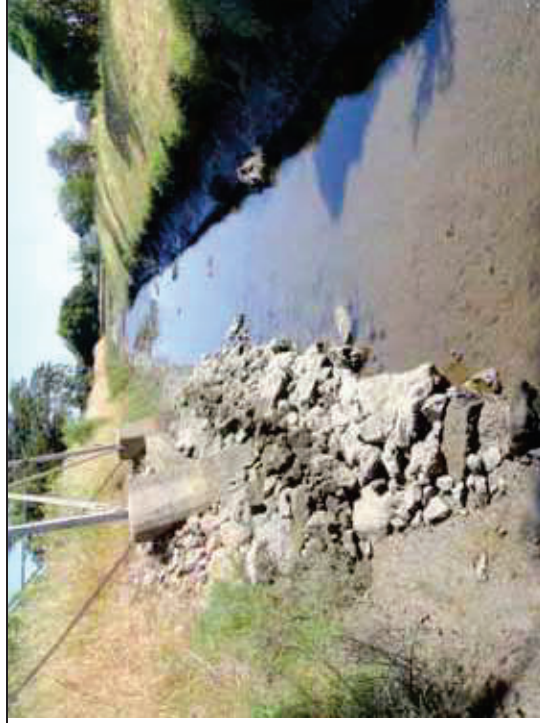
Nyhan Creek Left Bank: Waterside slope of rip rap around PG&E Tower north of Crest Marin Pump Station