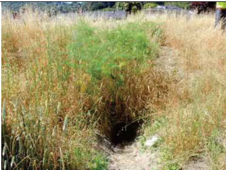
Coyote Creek Left Bank (~Sta 48+25): Storm drain inlet at landside toe, 18-inch corrugated metal pipe; ~2-inches of sediment