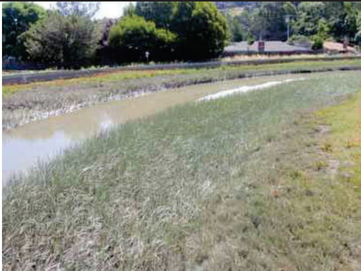
Coyote Creek Right Bank (~Sta 44+10): Vegetation and shoaling looking downstream from Flamingo Road Bridge