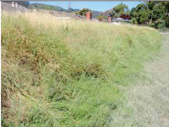
Coyote Creek Right Bank (~Sta 46+40): Waterside slope of GEI Cross-Section 3 looking upstream