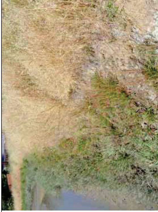
Nyhan Creek Left Bank: Waterside slope of GEI Cross-Section 2 looking upstream located ~300 feet north of Crest Marin Pump Station