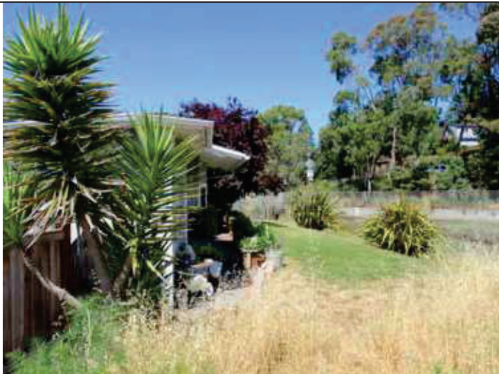
Coyote Creek Right Bank (~Sta 48+75): Plants, trees, and lawn on levee crest