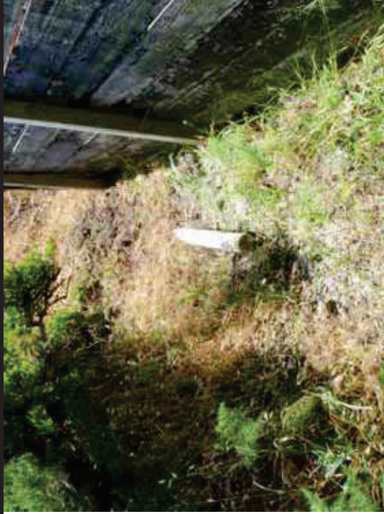
Coyote Creek Right Bank (~Sta 43+00): 4-inch PVC pipe at the landside levee toe