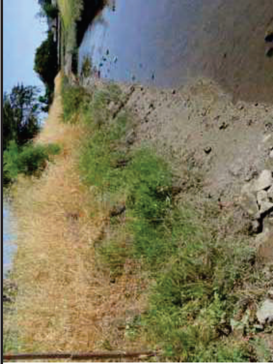
Nyhan Creek Left Bank: Waterside slope of GEI Cross-Section 1 looking downstream located ~100 feet north of Crest Marin Pump Station