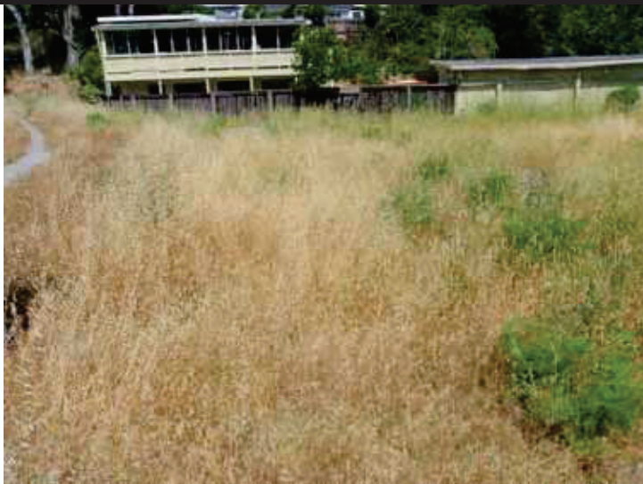
Coyote Creek Left Bank (~Sta 48+40): Landside slope of GEI Cross-Section 4 looking upstream