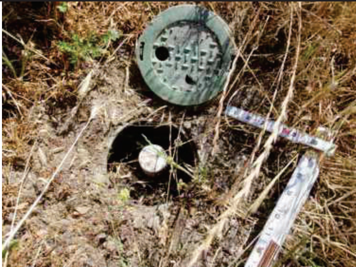
Coyote Creek Right Bank (~Sta 45+75): 1-inch irrigation control valve on the levee crest