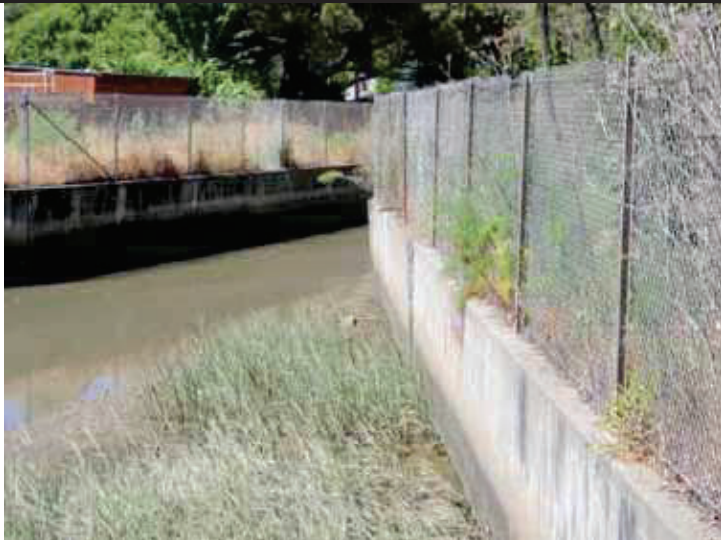
Coyote Creek Channel (~Sta 49+50): Left wing wall displacement at the end of the concrete channel section