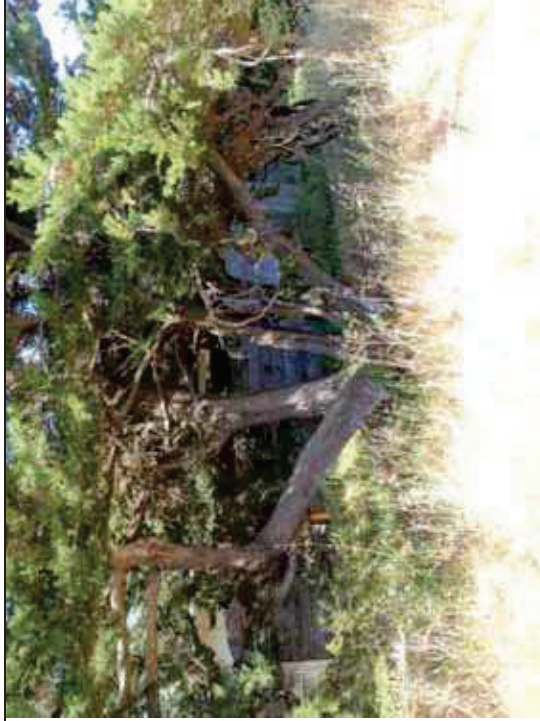
Coyote Creek Right Bank (~Sta 43+50): Tree at landside toe of levee