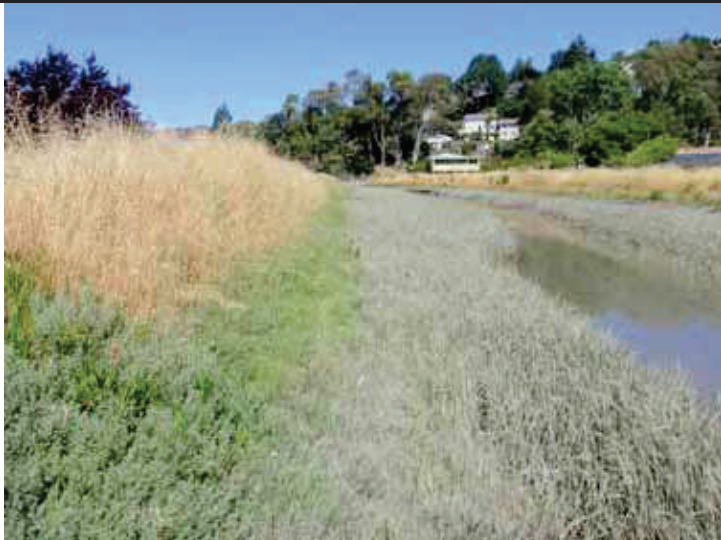
Coyote Creek Right Bank (~Sta 44+65): Waterside slope of levee looking upstream