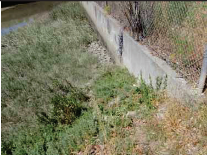
Coyote Creek Channel (~Sta 49+50): Shoaling and rip rap along left wing wall at the end of the concrete channel section