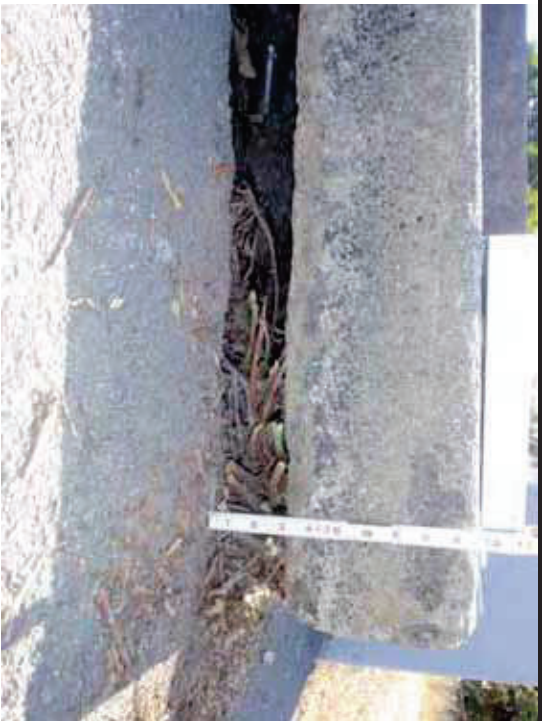
Coyote Creek Right Bank (~Sta 44+10): Settlement at the southeast corner of the Flamingo Road Bridge