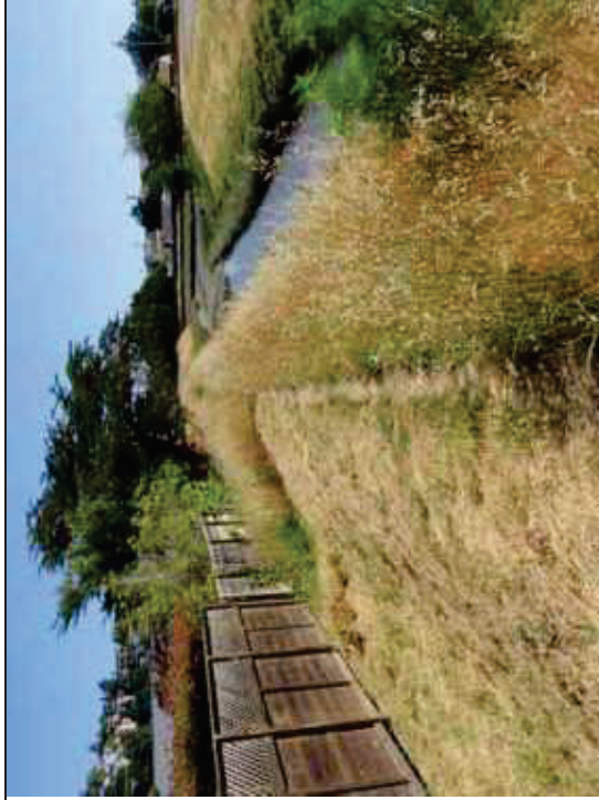
Nyhan Creek Left Bank: Vegetation on crest GEI Cross-Section 1 looking downstream located ~100 feet north of Crest Marin Pump Station