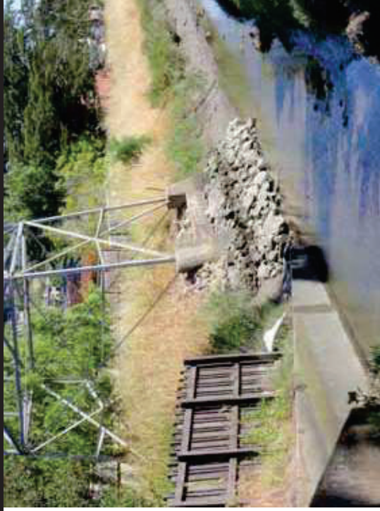
Nyhan Creek Left Bank: Rip Rap around PG&E Tower north of Crest Marin Pump Station