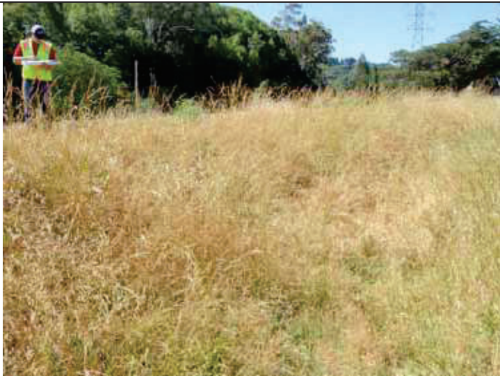
Nyhan Creek Left Bank: Landside slope of GEI Cross-Section 2 looking upstream located ~300 feet north of Crest Marin Pump Station