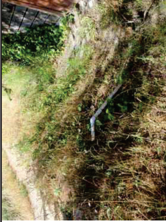
Nyhan Creek Left Bank: 2-inch PVC pipe on the landside ~80 feet north of GEI Cross-Section 1