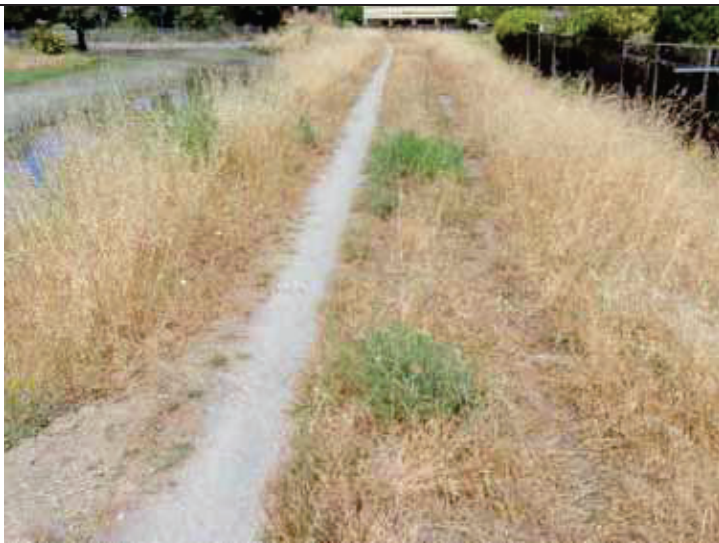
Coyote Creek Left Bank (~Sta 47+00): Crest of GEI Cross-Section 5 looking upstream