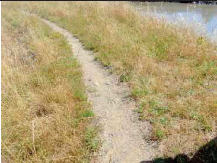
Nyhan Creek Left Bank: Crest of GEI Cross-Section 2 looking downstream located ~300 feet north of Crest Marin Pump Station