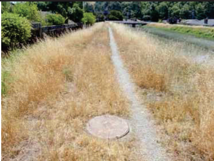
Coyote Creek Left Bank (~Sta 48+10): Storm drain manhole on levee crest looking downstream