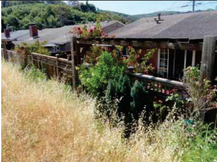
Coyote Creek Right Bank (~Sta 47+25): Plants and trellis at levee toe