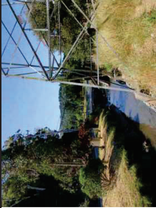
Nyhan Creek Left Bank: Vegetation around Crest Marin Pump Station looking south