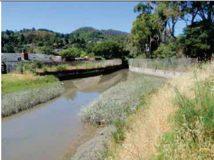
Coyote Creek Channel (~Sta 49+50): Looking upstream at concrete channel section