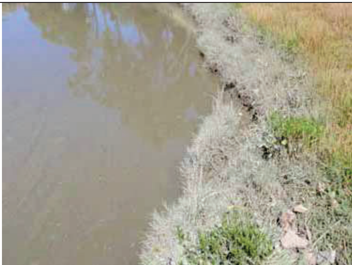
Coyote Creek Left Bank (~Sta 48+40): Waterside toe erosion at GEI Cross-Section 4