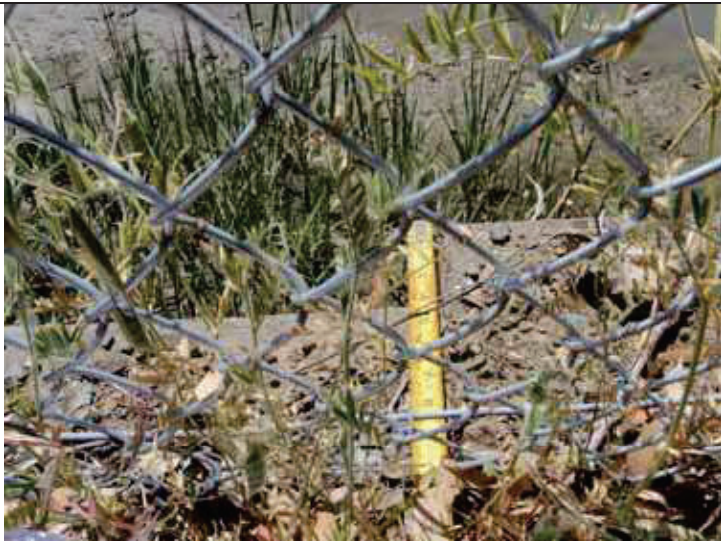
Coyote Creek Left Bank (~Sta 49+50): Left wing wall displacement at the end of the concrete channel section, 4-inches