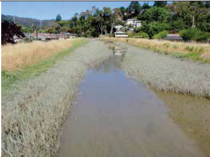
Coyote Creek Right Bank (~Sta 44+50): Vegetation and shoaling looking upstream from Flamingo Road Bridge