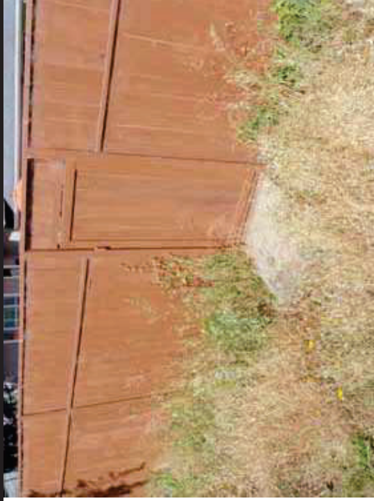
Nyhan Creek Left Bank: Small wooden walkway from fence to levee toe landside ~100 feet north of GEI Cross-Section 1