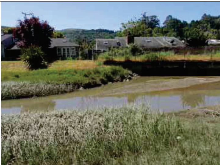
Coyote Creek Channel (~Sta 49+50): Shoaling at the end of the concrete channel section