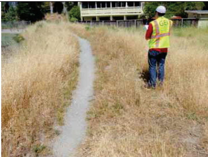
Coyote Creek Left Bank (~Sta 48+40): Crest of GEI Cross-Section 4 looking upstream