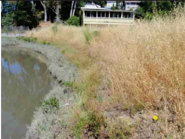
Coyote Creek Left Bank (~Sta 48+40): Waterside slope of GEI Cross-Section 4 looking upstream