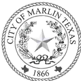
Susan Byrd, Mayor

PASSED AND APPROVED ON THIS THE 12TH DAY OF September 2023.