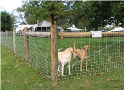
e. Welded Wire