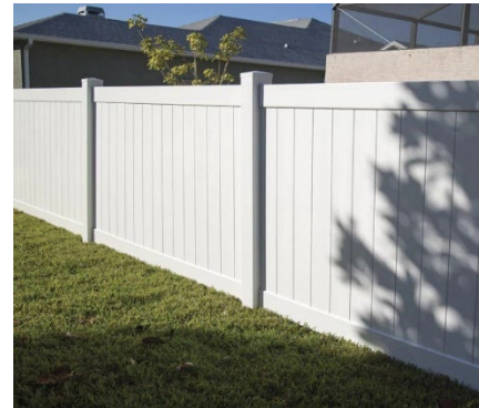
e. Vinyl Picket and/or Slat