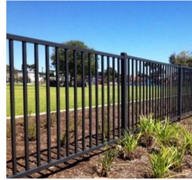
b. Ornamental Aluminum, Iron, or Steel