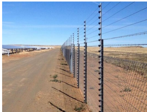
b. Electric Fence for Non-Farm Purposes