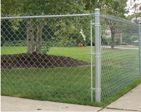
c. Chain Link