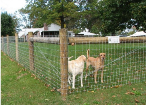
e. Welded Wire