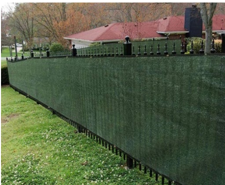
c. Flammable Material