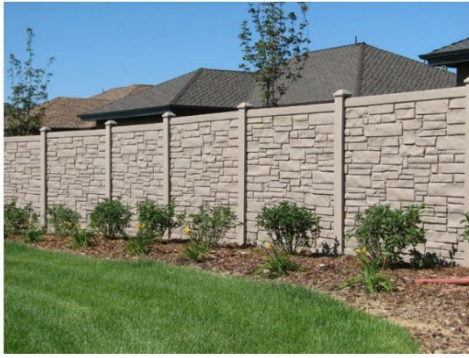
a. Masonry or Stone Wall