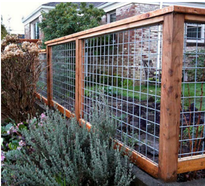
f. Framed Welded Wire