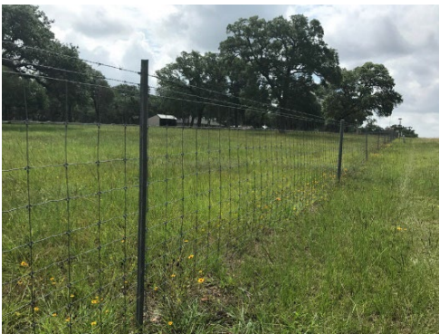
a. Barbed or Razor Wire