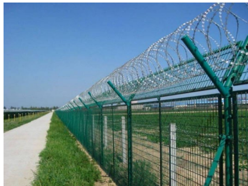
d. Concertina Wire