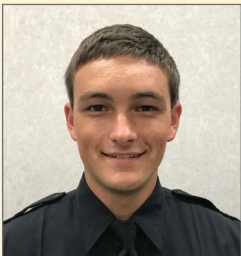
Troy Snyder Police Department