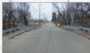
6 - Ninth Street bridge