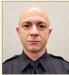
Cody Gebele Police Department