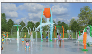
4 - Aquatic Center project