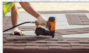
7 - Home repair funds