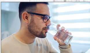
Insert - Water Quality Report