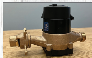
7 – Water meter changeout