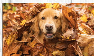
6 – Leaf collection