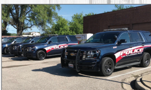
5 – PD requests citizen help