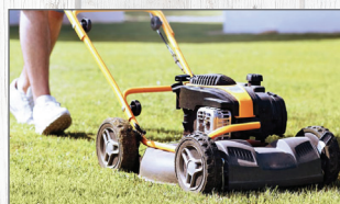
6 - Summer disposal tips