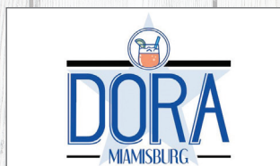
2 - DORA times