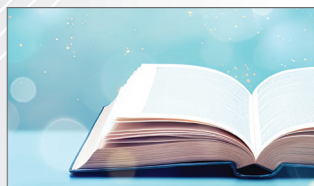
4-5 – Library News