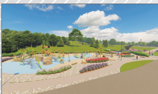
1 – Parks Update