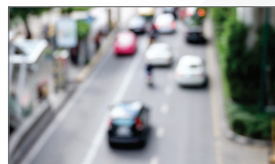
7 – Transportation Plan