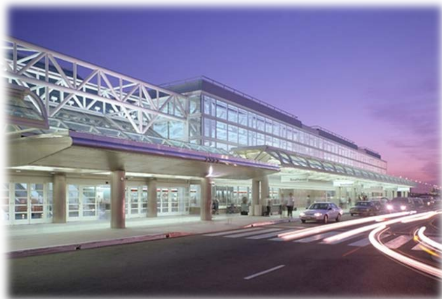
Ontario International Airport (ONT), Ontario, California