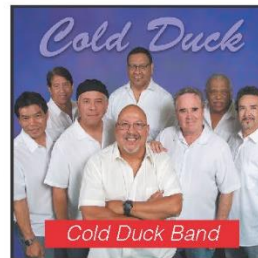
Cold Duck Band