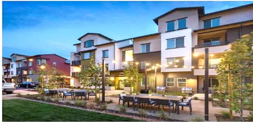
Alexan Kendry in Montclair, California, takes cues from its history. In the early 1900s, the area was once blanketed with citrus orchards and farming. Builder Trammell Crow Residential and architect Architecture Design Collaborative decided to design the community as a modern interpretation of the farmhouse. Of all the four-story and under multifamily projects, the judging panel admired this one the most because of the façade and its use of color and the project's site plan on an L-shaped site that considers the pedestrian experience.