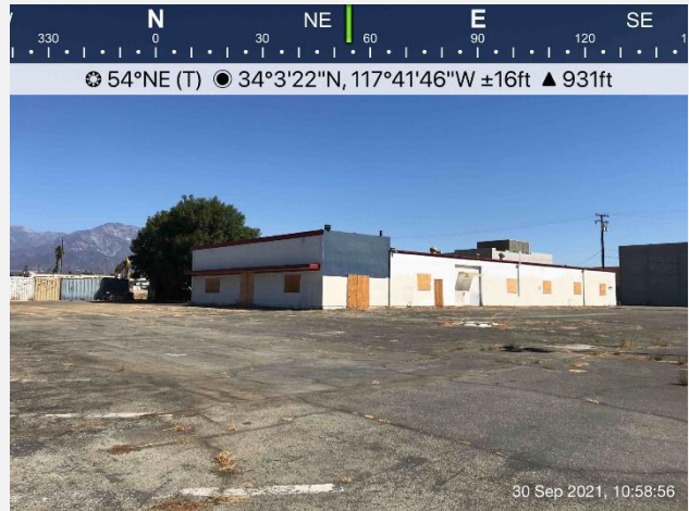
Photo 4. Developed pre-existing building with ornamental trees adjacent.