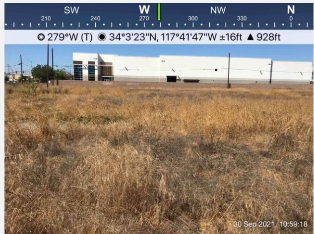
Photo 2. Disturbed non-native annual grassland