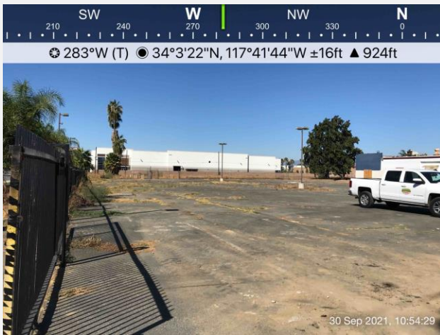
Photo 1. Developed pre-existing parking lot with ornamental trees in background.