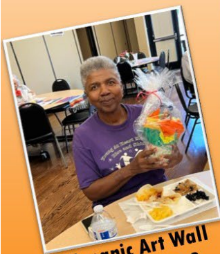
Hispanic Art Wall October 6, 2022