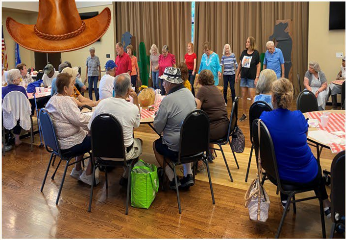
Senior Birthday Party: "Western Hoe-Down" September 28, 2022