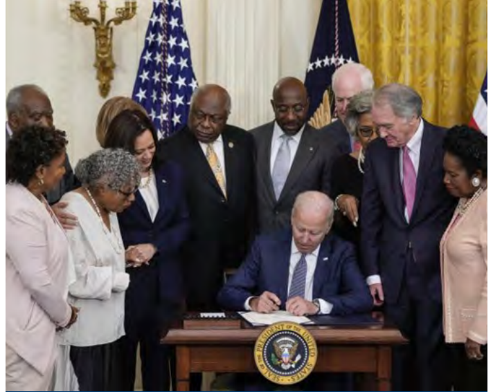
President Joe Biden signs the Juneteenth National Independence Day Act into law on June 17th, 2021.

In 2021, Juneteenth was established as a federal holiday, opening it to symbolic and global interpretation and providing a better understanding of the evolution of our nation and its people. Juneteenth celebrations then, like now, recognize the ongoing fight for human rights and equality and are commemorated through family cookouts, faith services, musical performances and storytelling. Today, Juneteenth celebrates African American resilience and achievement while aiding in the preservation of those historical narratives that promoted racial and personal advancement since Freedom Day.