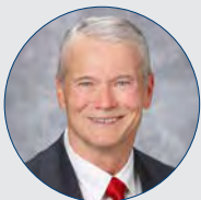
Mayor Ron Messer