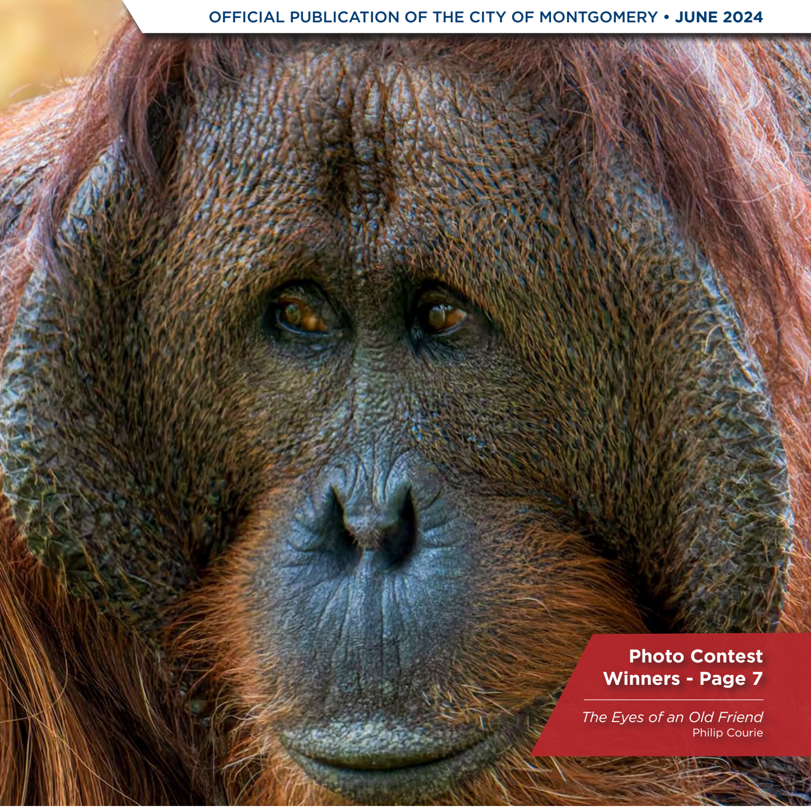
Photo Contest Winners - Page 7

OFFICIAL PUBLICATION OF THE CITY OF MONTGOMERY • JUNE 2024