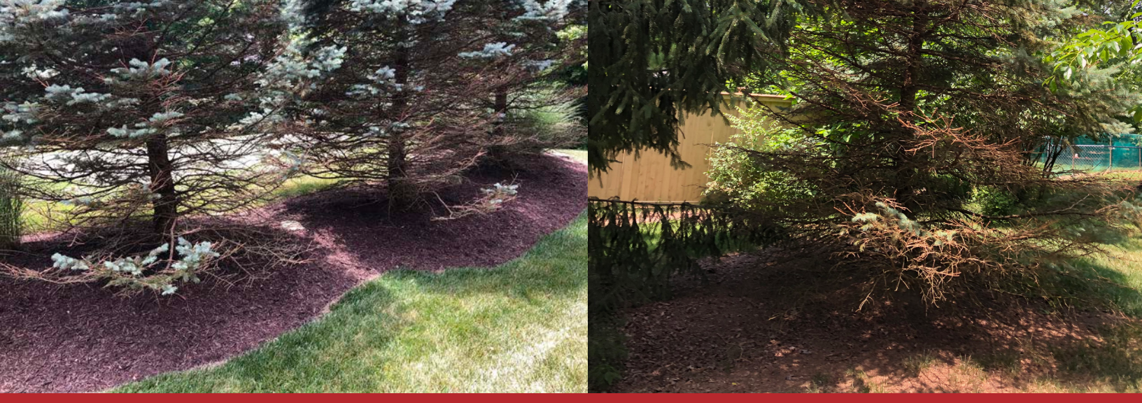
Here are two examples of Rhizospera needle cast infection on a Colorado blue spruce tree.