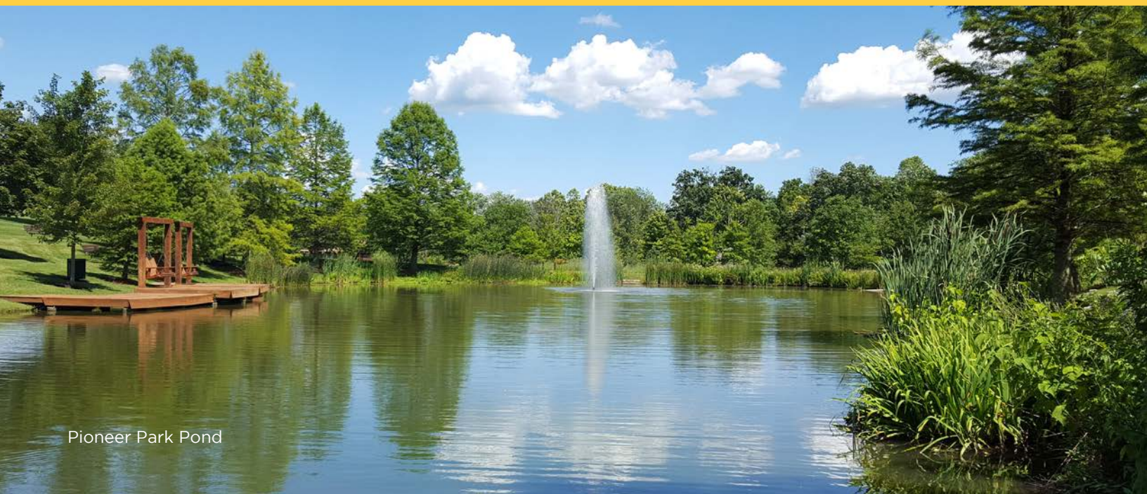
Pioneer Park Pond

As the cold weather breaks, everyone is encouraged to get outside and be active in Montgomery Parks. Whether you are looking for a calm, quiet stroll in Pioneer Park around the lake and butterfly gardens, a hike throughout Johnson Nature Preserve, or running through Swaim or Weller Parks, Montgomery Parks have a place for everyone and every age to get outside and be active. For park locations and amenities, please visit montgomeryohio.org .