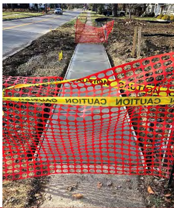
Montgomery's sidewalk repair initiative helps keep City sidewalks safe for residents.