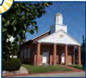
City of Montgomery, Ohio

Once completed, participants can turn in the workbook any time, Monday through Friday, from 8:00 a.m. to 4:30 p.m. at Montgomery City Hall, 10101 Montgomery Road.