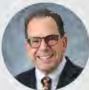
Vice Mayor Craig Margolis