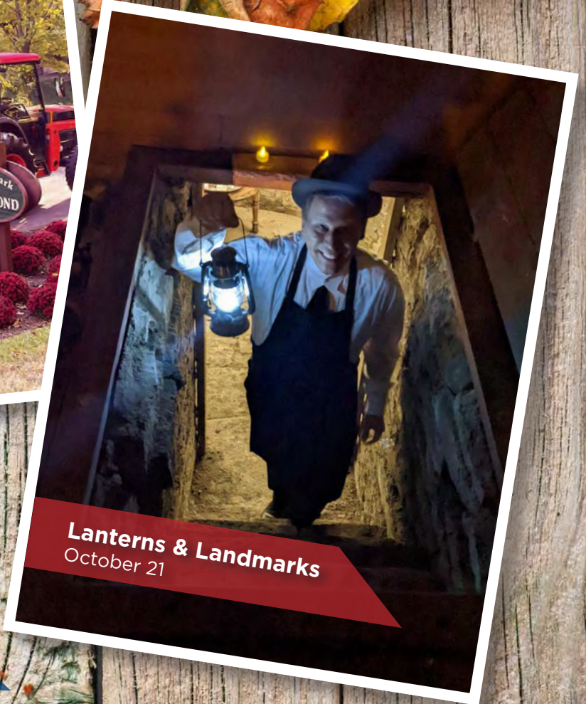
Lanterns & Landmarks October 21

Two Upcoming Events: Lanterns & Landmarks and Harvest Moon