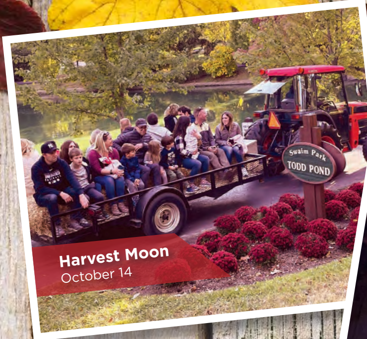
Harvest Moon October 14

OFFICIAL PUBLICATION OF THE CITY OF MONTGOMERY • OCTOBER 2023