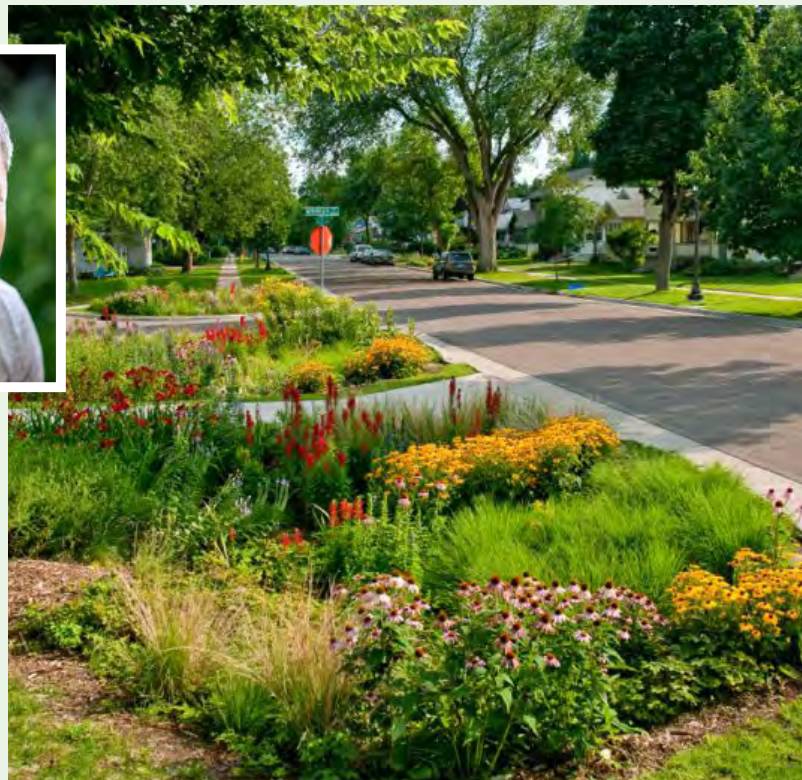
Photo: Rain Garden featured in The Native Plant Herald