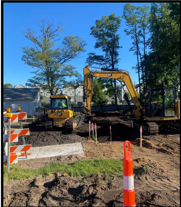
Site Grading Trailhead at W Mechanic Street and N Smith Street Intersection

The contractor also continued site grading and laying the aggregate base layer of the non-motorized trail working southwest from N Monroe Street. The path will transition from concrete to asphalt at the N Monroe Street and US-12 intersection.