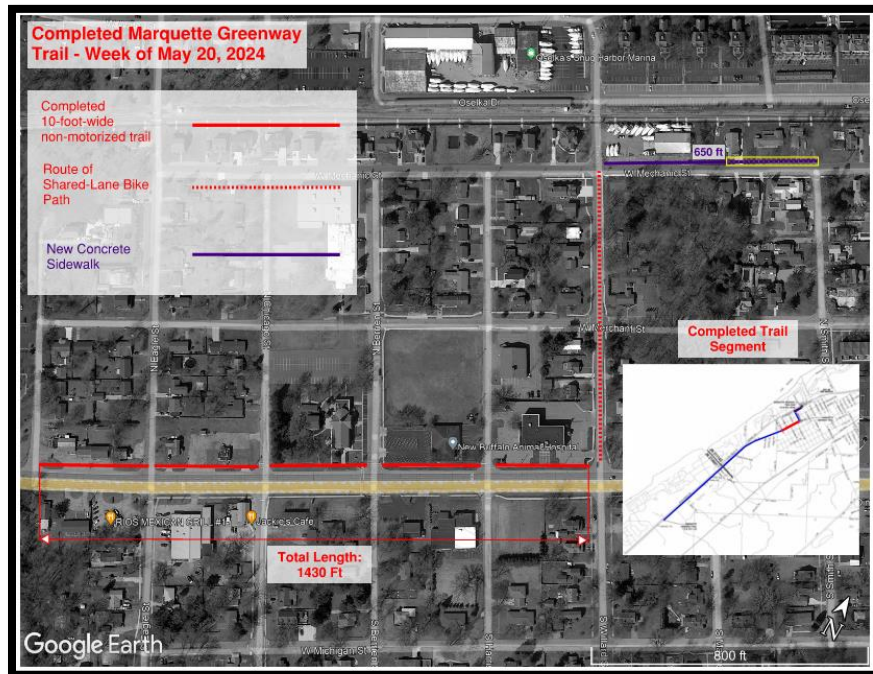
Figure1. Completed Marquette Greenway Trail- Week of May 27, 2024

Within the city limits of New Buffalo, Martin J Concrete Inc. poured concrete for the 10-foot-wide section of the Marquette Greenway Trail. The sub-contractor is scheduled to complete the remaining ADA ramps and concrete driveways in the upcoming weeks. Please see Figure 1.