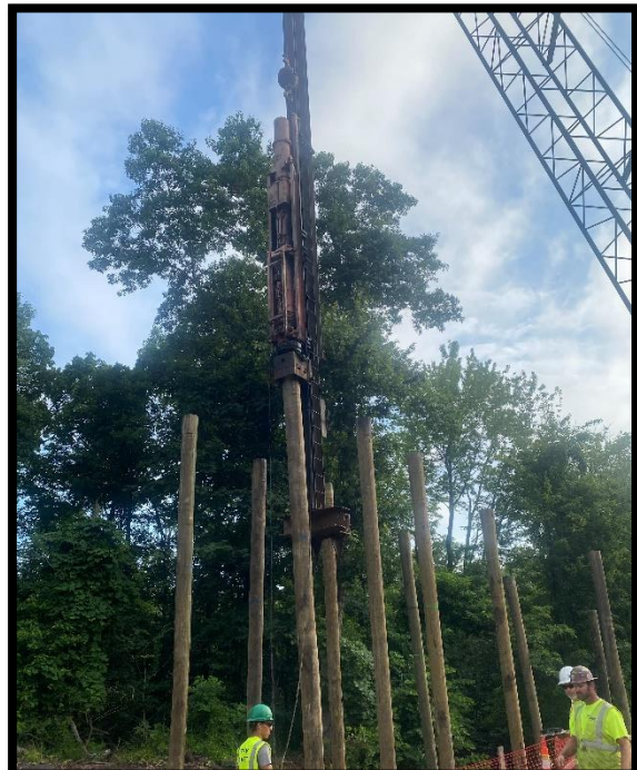
Hammer Drill Driving Timber Piles

Next week, Anlaan Corporation will continue construction of the boardwalk, southwest of the retaining wall location. With the timber piles installed, the contractor will begin installing cross members for the boardwalk.