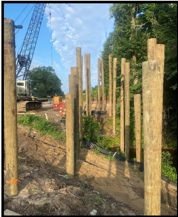
Installed Boardwalk Timber Piles