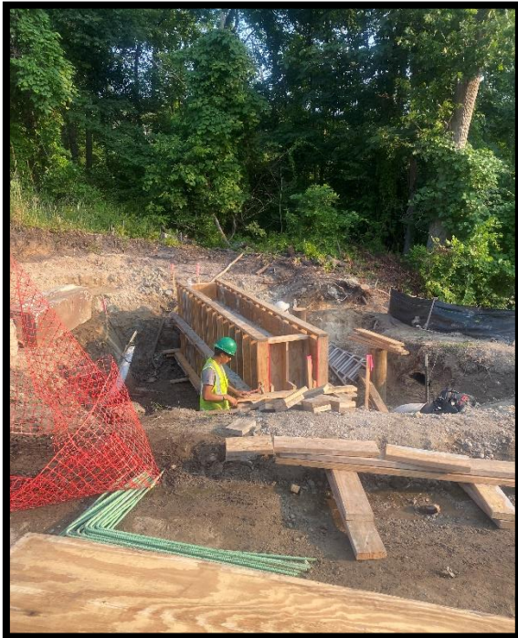
Removing Forms for Boardwalk Abutment

Next week, Kalin Construction will continue laying and grading the aggregate base layer for the non-motorized trail southwest of the boardwalk location. The contractor will work with D-K Fence Company who is scheduled to install the security fence along the Amtrak easement.