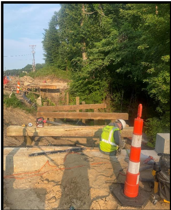
Beginning of Boardwalk Installation