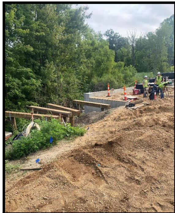
Installation of Cross Members for Boardwalk