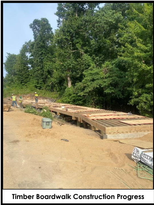
Timber Boardwalk Construction Progress

Anlaan Corporation continued construction of the timber boardwalk southwest of the retaining wall location along US-12. The sub-contractor continued installing boardwalk cross members and headers.