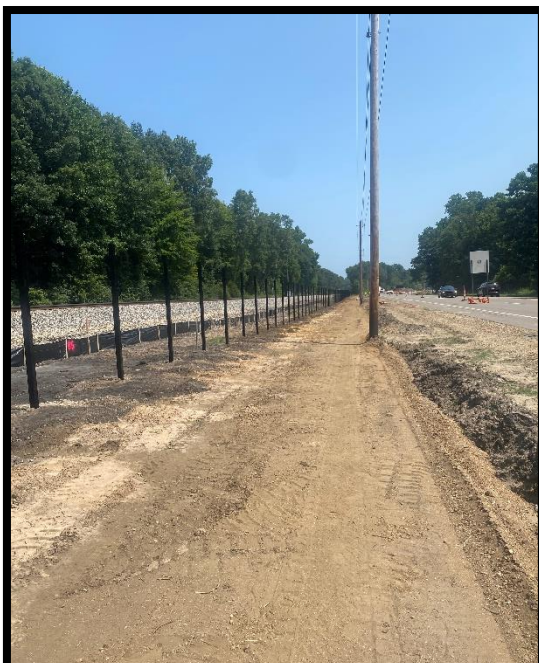
Security Fence Posts and Foundation

Kalin Construction also began drainage ditch construction along US-12. The drainage ditch is a 'French Drain System'. This system consists of a trench filled with perforated pipe and gravel that allows water to drain naturally. The contractor also worked with D-K Fence Company to install security fence posts and their foundations.