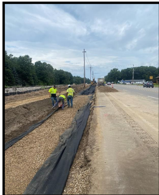
French Drain System Installation