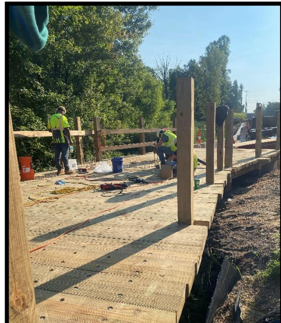
Timber Boardwalk: Deck Boards & Railings

Marquette Greenway Trail updates within the city limits of New Buffalo are complete, with the overall project anticipated to be finished by September 27, 2024. Please see Figure 1.