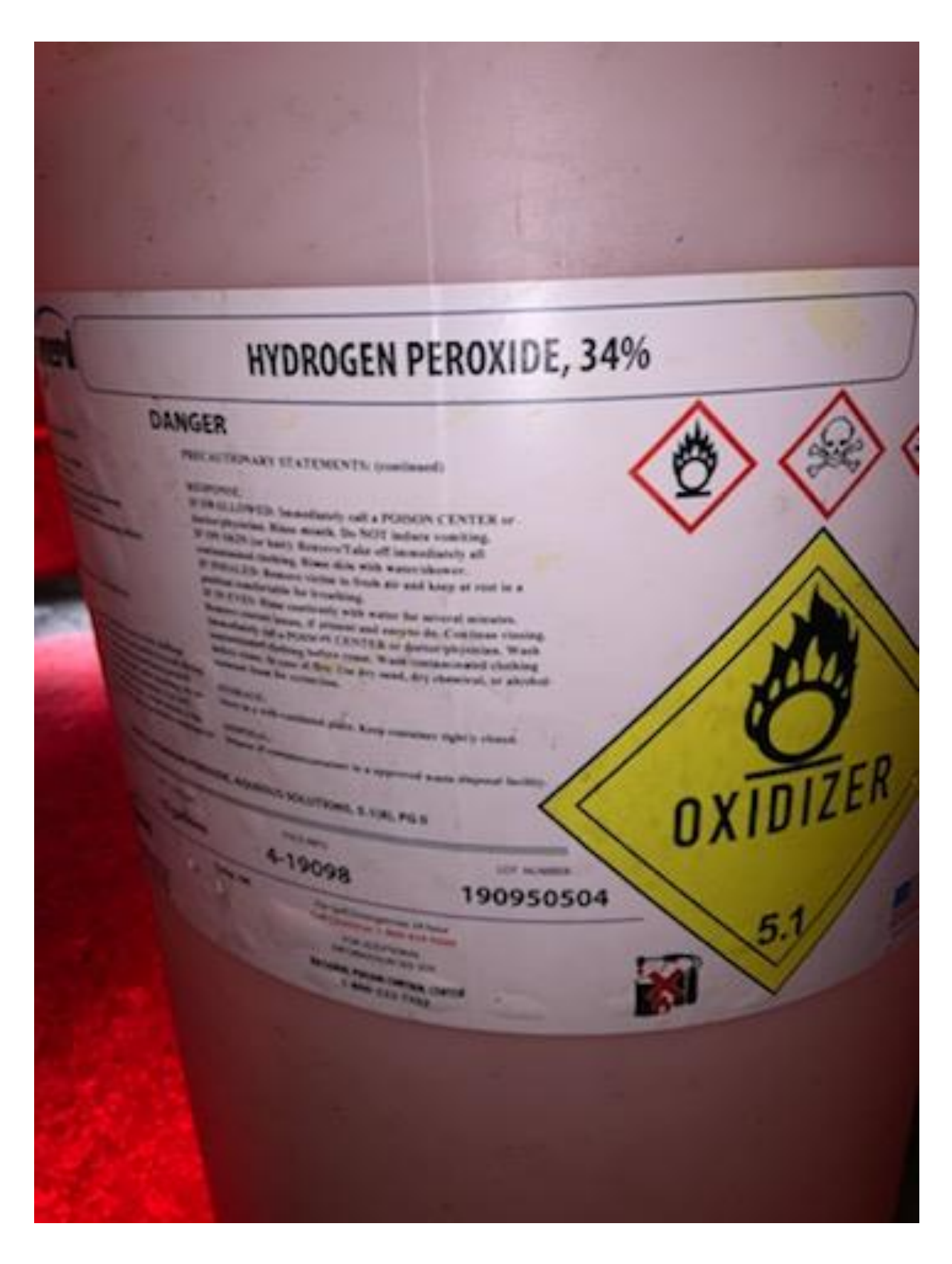
The water system uses hydrogen peroxide as a sanitizer.