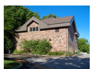
Shafor Water Treatment Plant