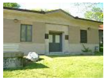
Springhouse Water Treatment Plant

The city of Oakwood owns and operates a public municipal water system that serves the residents and businesses throughout the community. The system is comprised of eight production wells, three water treatment plants, 44 miles of underground water lines, 352 fire hydrants and a 1.5 million gallon water tower. The Director of Engineering and Public Works oversees the operation of the public water system. The Water Plant Superintendent is charged with the day-to-day operation of the wells, water tower and water treatment plants.