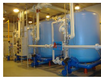
Softening Units at Shafor Water Treatment Plant