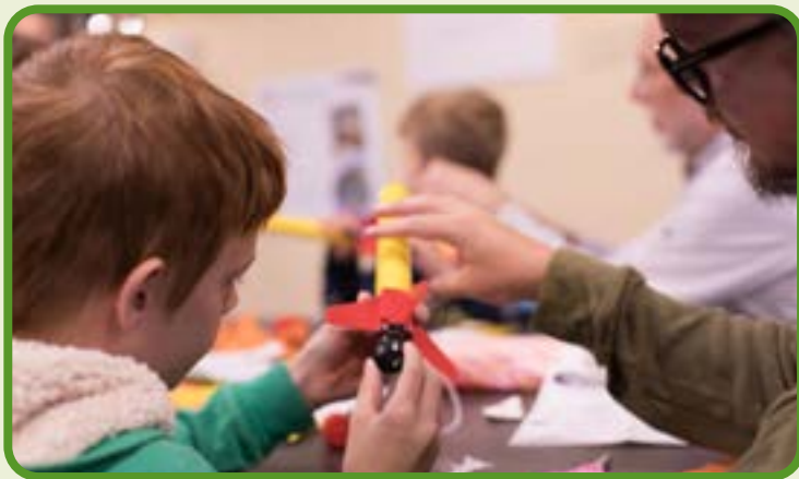
This September, children were able to build and launch rockets thanks to a program grant from the Library Foundation.