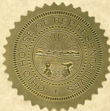
ROBERT R. CUPP SPEAKER OHIO HOUSE OF REPRESENTATIVES