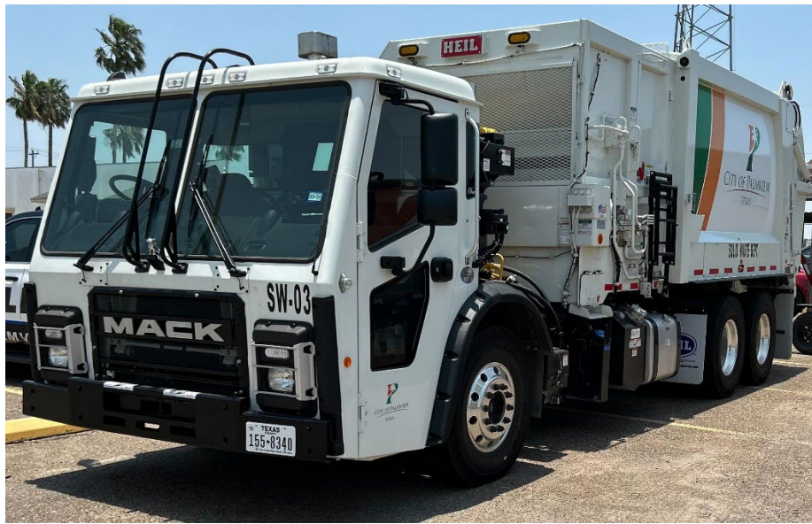
2023 Mack -LR64 (Side Loader for Garbage Collection)