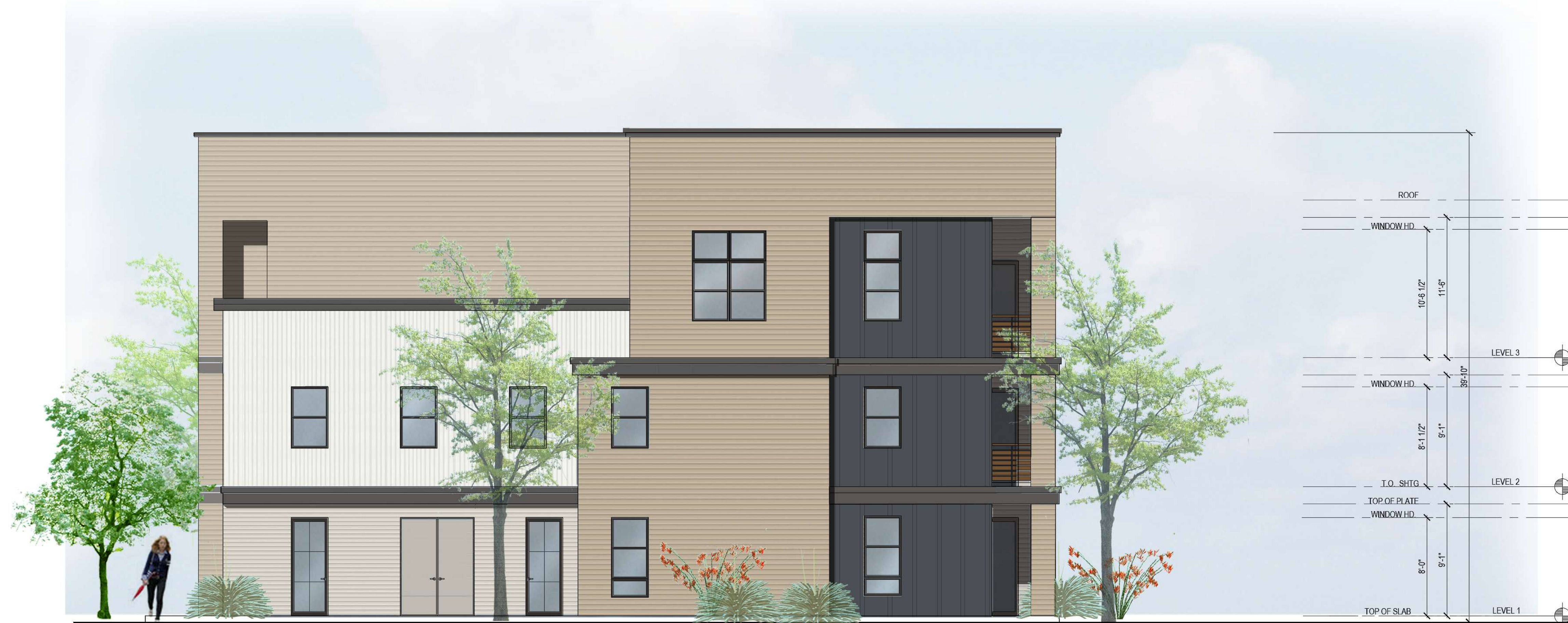
CHARACTER ELEVATION - BLDG. TYPE A (RIGHT)