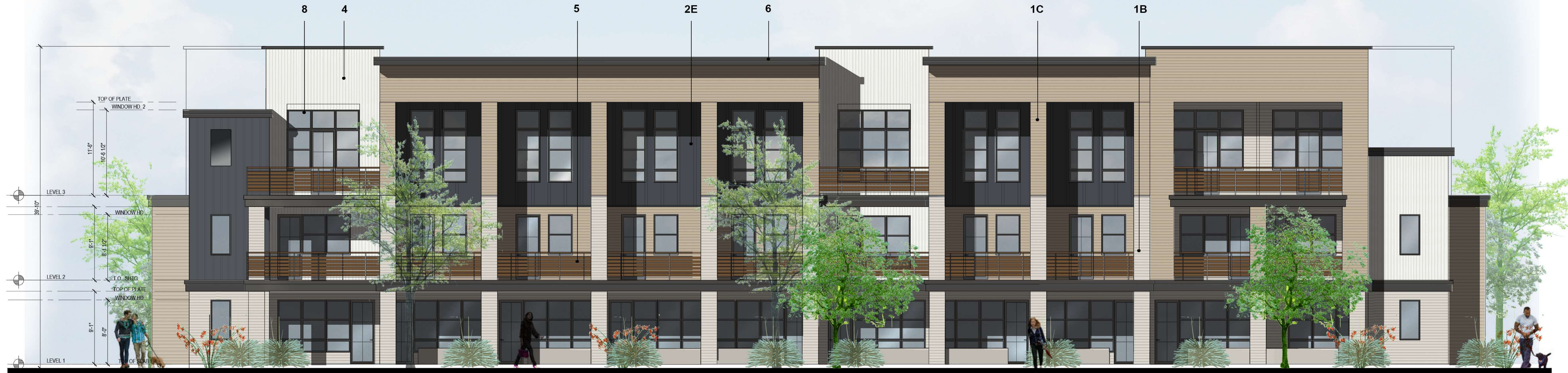
CHARACTER ELEVATION - BLDG. TYPE A (FRONT)