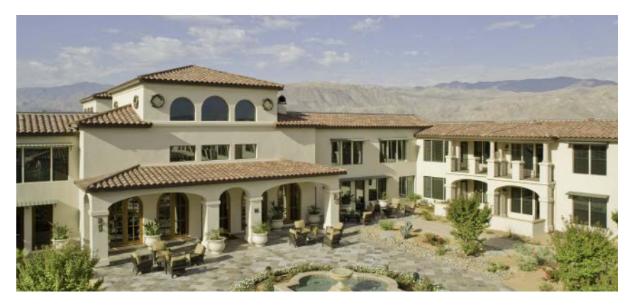
SEGOVIA - PALM DESERT, CA