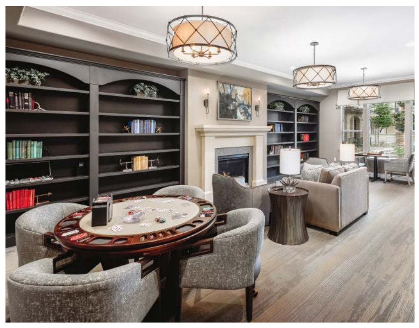
CARD & GAME ROOM AT SANTIANNA - CARLSBAD, CA