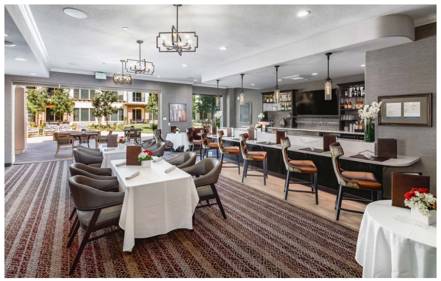
BAR & LOUNGE AT SANTIANNA - CARLSBAD, CA