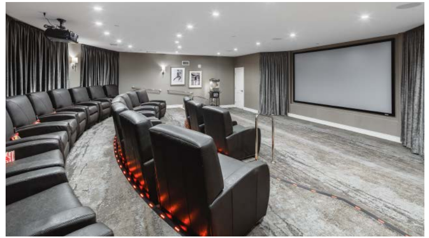
MOVIE THEATER AT SANTIANNA - CARLSBAD, CA