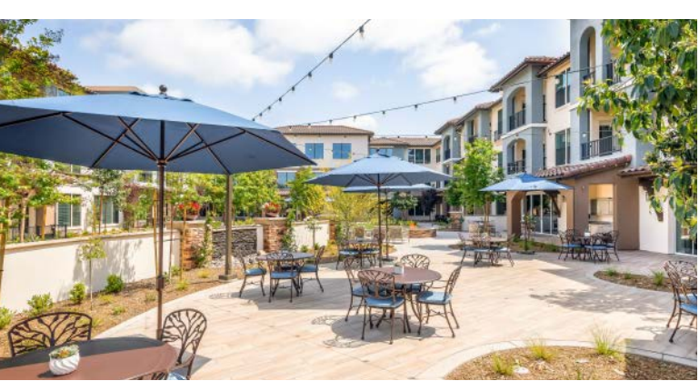
COURTYARD AT SANTIANNA - CARLSBAD, CA