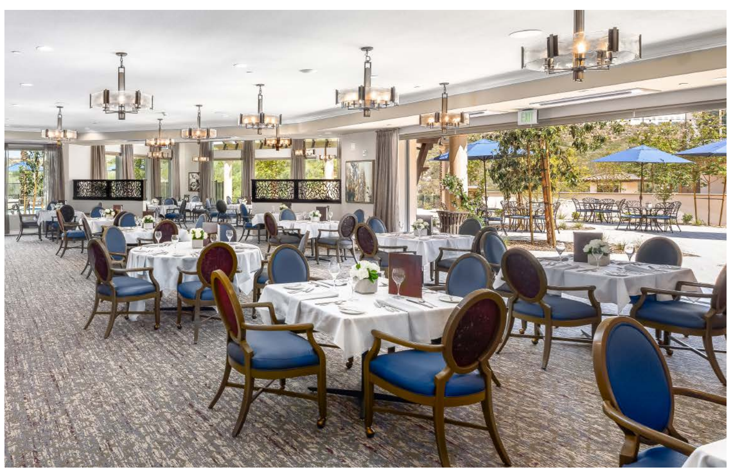
DINING ROOM AT SANTIANNA - CARLSBAD, CA