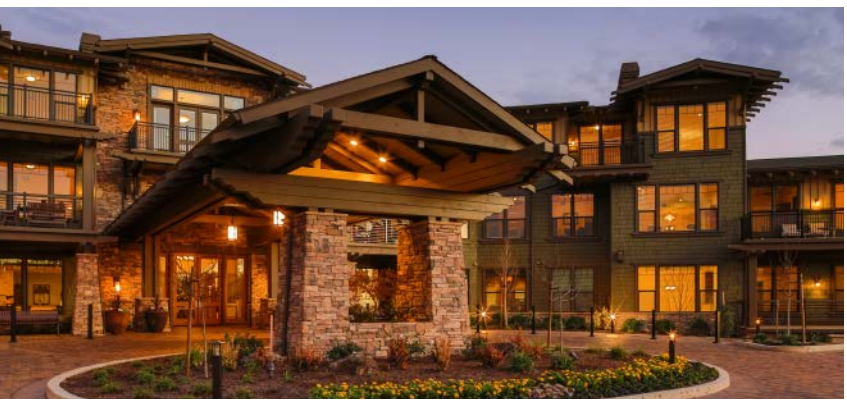
FOUNTAINGROVE LODGE - SANTA ROSA,CA