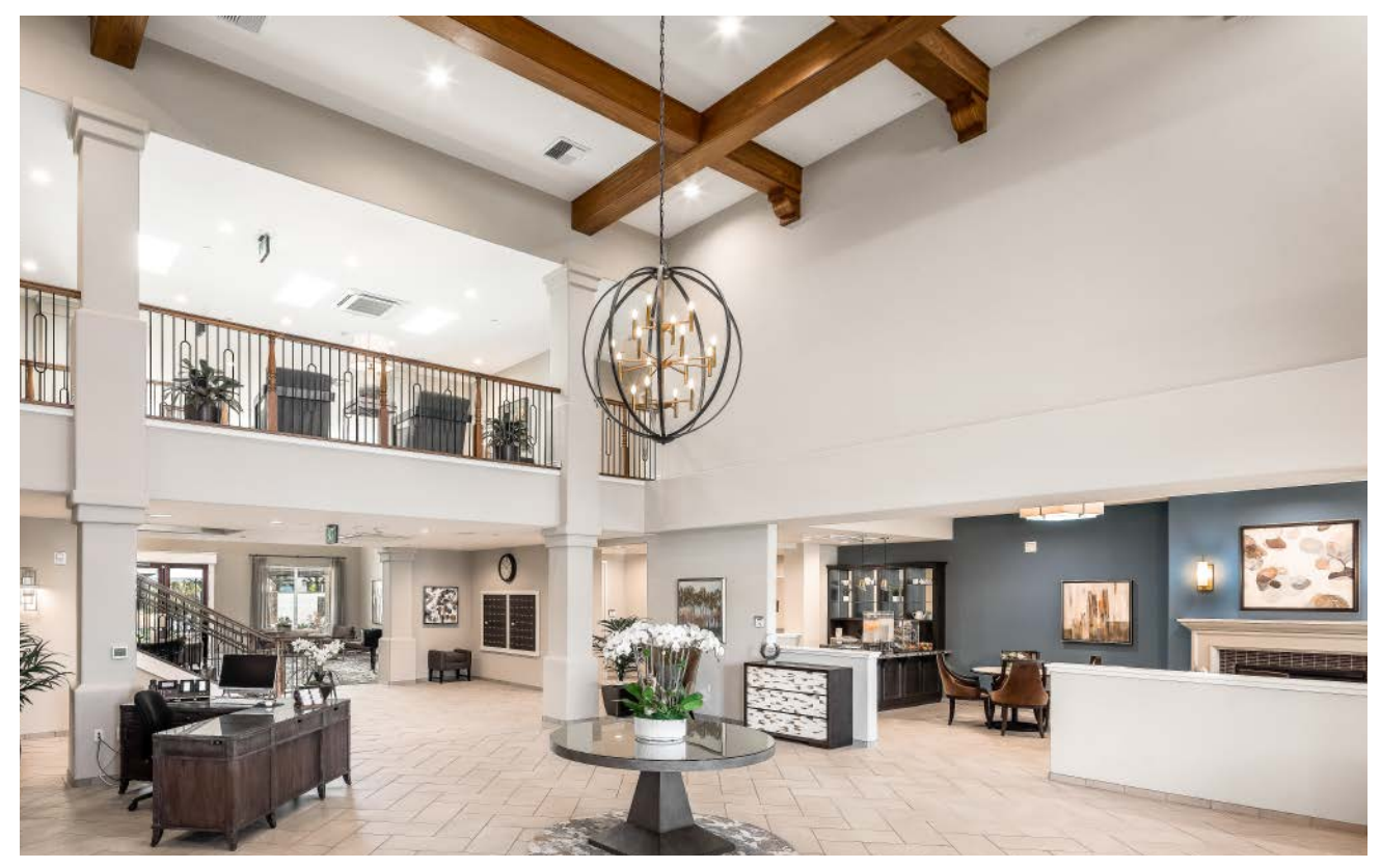
LOBBY AT LAUREL HEIGHTS - MOORPARK, CA

A WIDE RANGE OF LUXURY AMENITIES & SERVICES PROVIDED.