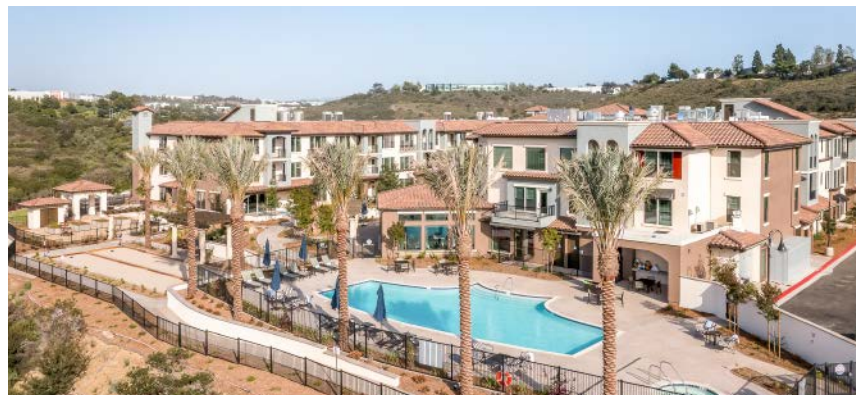
SANTIANNA - CARLSBAD, CA