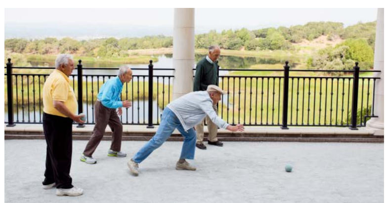
BOCCE BALL AT VARENNA - SANTA ROSA, CA