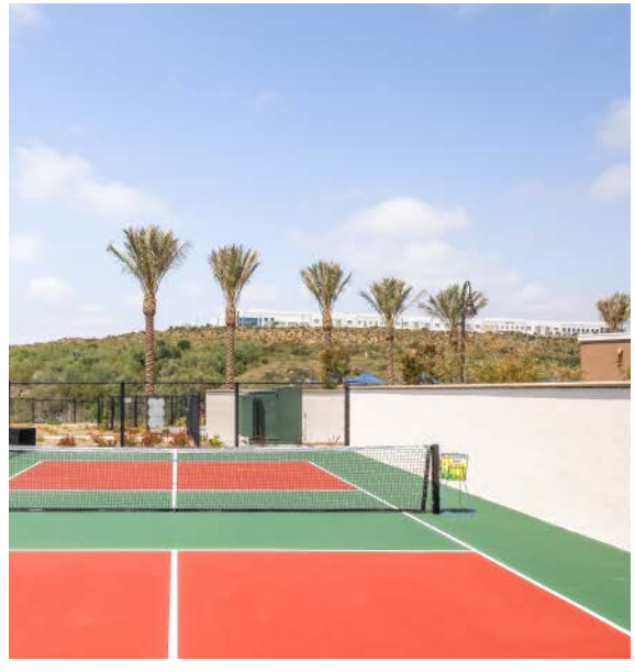
PICKLEBALL AT SANTIANNA - CARLSBAD, CA