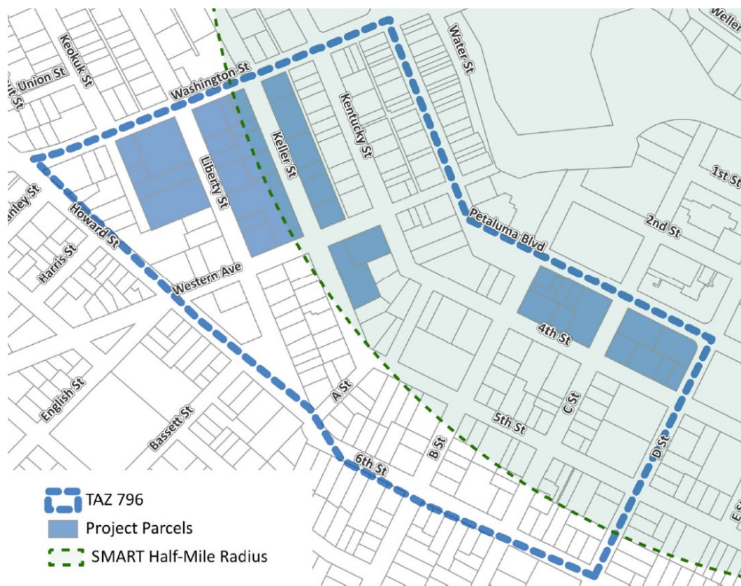
Plate 1 – Project Parcels and SMART Proximity

Unlike the zoning overlay component of the project, site-specific development details are known for the proposed Appellation Hotel project on the southwest corner of Petaluma Boulevard South/B Street. The hotel was found to qualify for major transit stop VMT screening in the Traffic Impact Study for the Petaluma Appellation Hotel Project , W-Trans, September 2023. That report provides further details, including a discussion of both the employee and visitor VMT characteristics of the hotel.