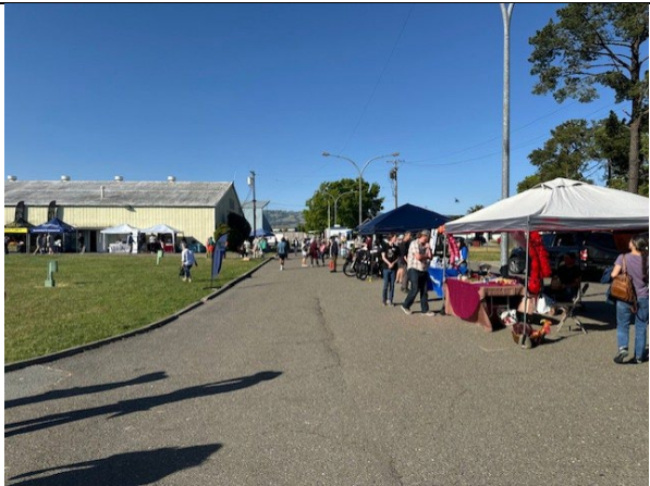
Harvest Beats event