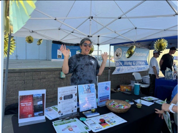
Harvest Beats event