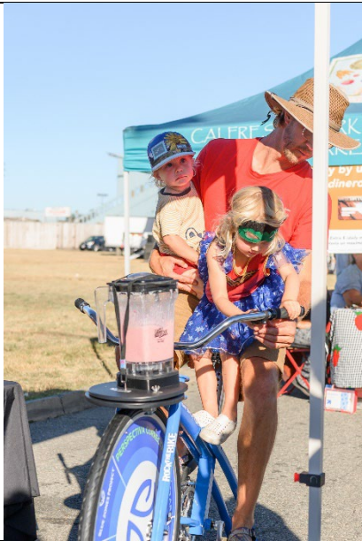
Fair Food Vendor