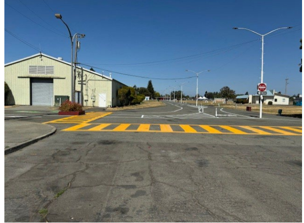
New, one way striping installed along Gnos Concourse