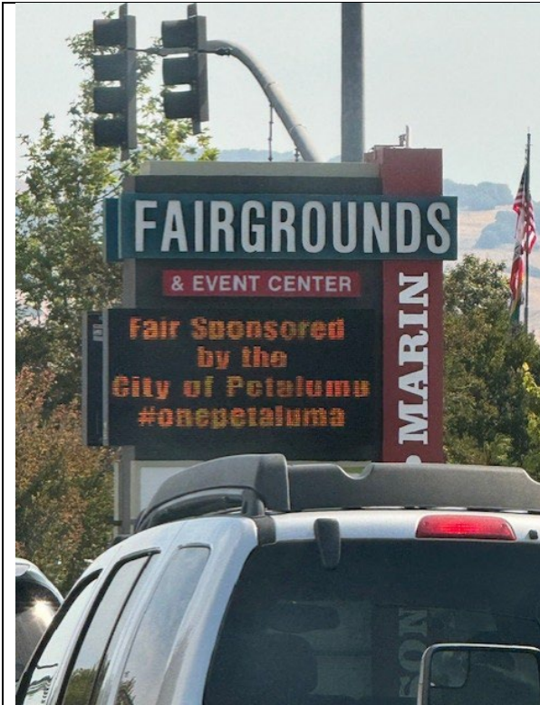
Repaired electric sign and transitioned programming to city