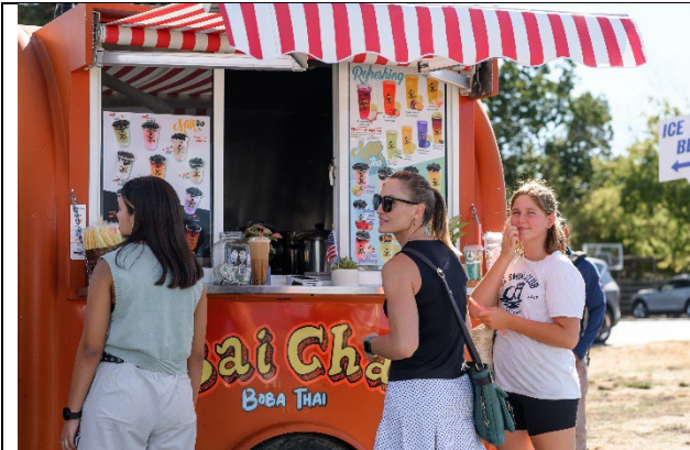
Fair Food Vendor