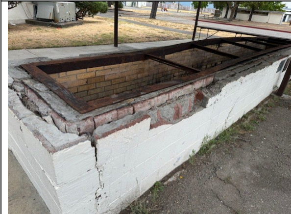
Fairgrounds BBQ Pit