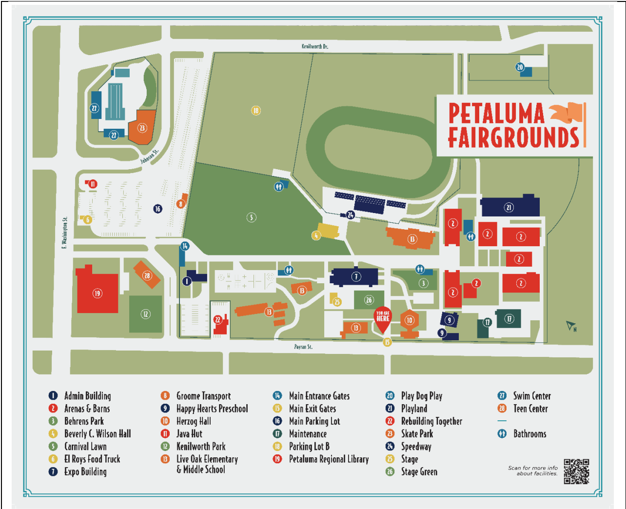
New wayfinding signage to be installed