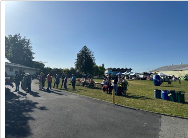
Harvest Beats event