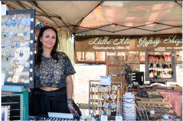
Fair Goods Vendor