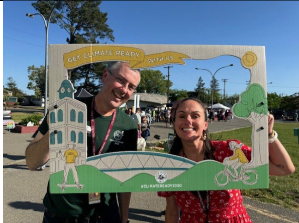
Harvest Beats event