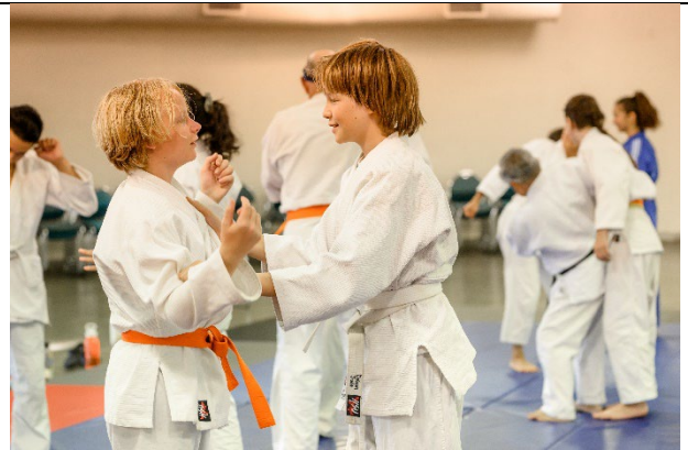
Judo at the Fairgrounds