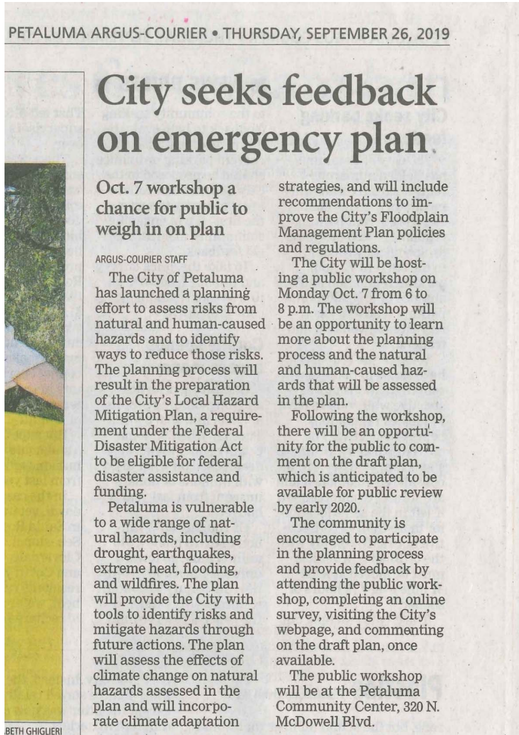
Figure A.5. Newspaper Article Advertising the 1 st Public Workshop