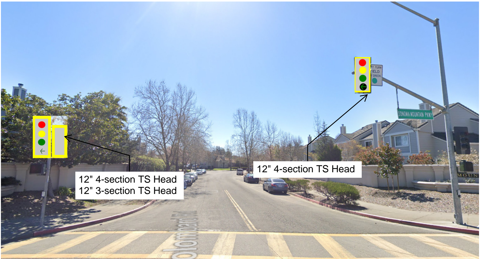
SMP and ELY N. (Eastbound)

12" 4-section TS Head 12" 3-section TS Head