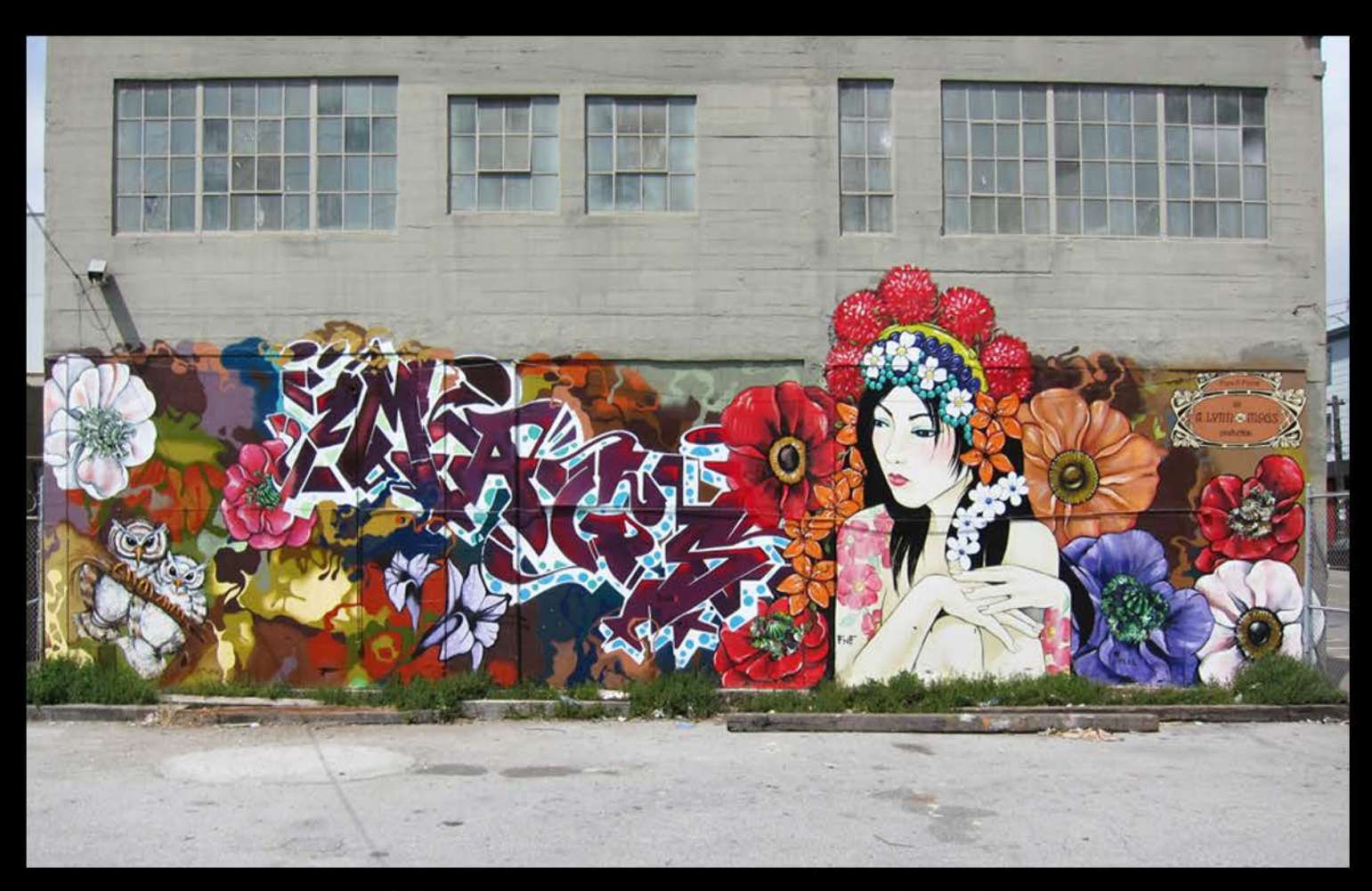
ALYNN-MAGS, SAN FRANCISCO, CA 2013