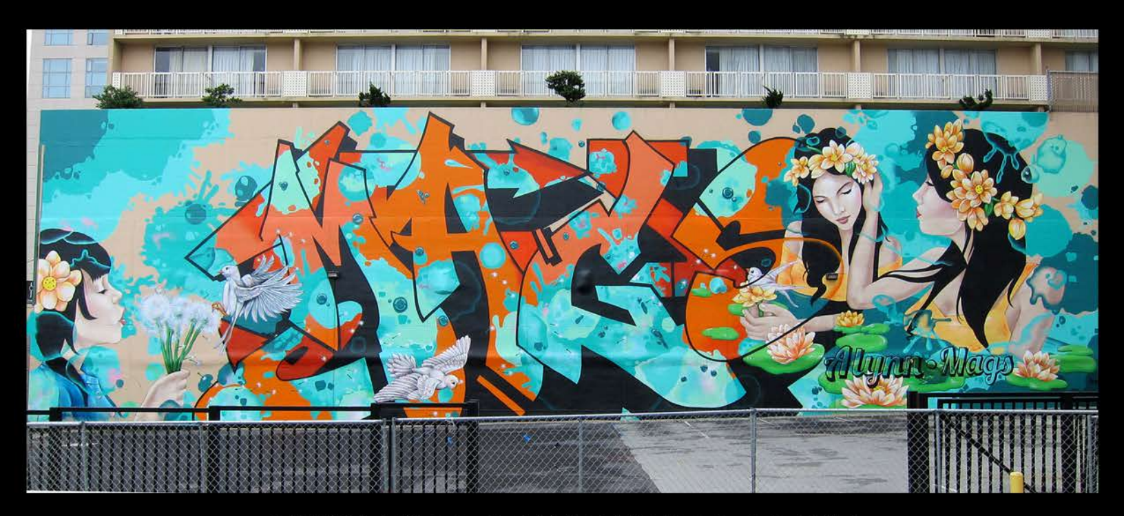
ALYNN-MAGS, SAN FRANCISCO, CA 2014