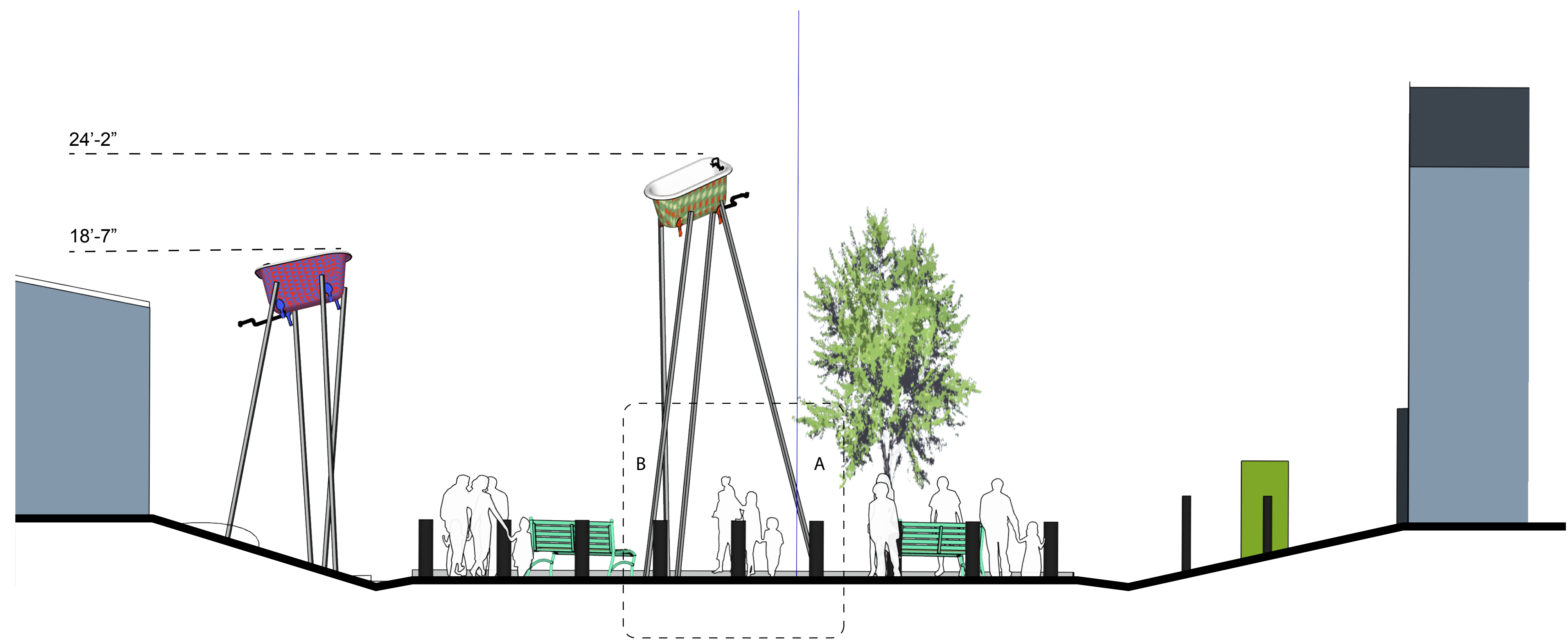
SOUTHWEST ELEVATION 1/4" = 1'-0"